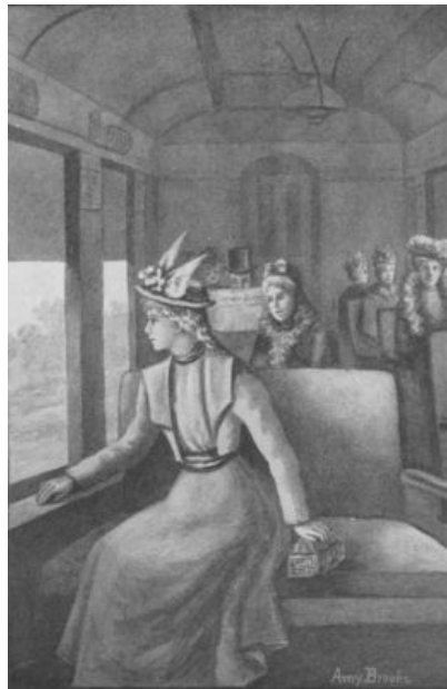
As she looked from the window and saw the flying landscape

Accordingly she sat up, and wiping her tears, made a determined effort to look as she felt sure that a girl should look who was starting out for a delightful visit.