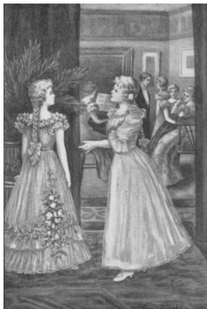
Randy urges Polly to sing

Among the happy faces Randy saw one less bright than the others. It was Polly Lawrence, and Randy wondered what had caused a frown upon the usually smiling face. "It would never do to ask her why she isn't enjoying my party," she said to herself, "but I do wish she looked happier. I am so happy this evening, that I wish everyone else to enjoy every moment of it. I believe I'll ask her to sing for us. She sings nicely, and perhaps she would be pleased to, if she knew we wished it."