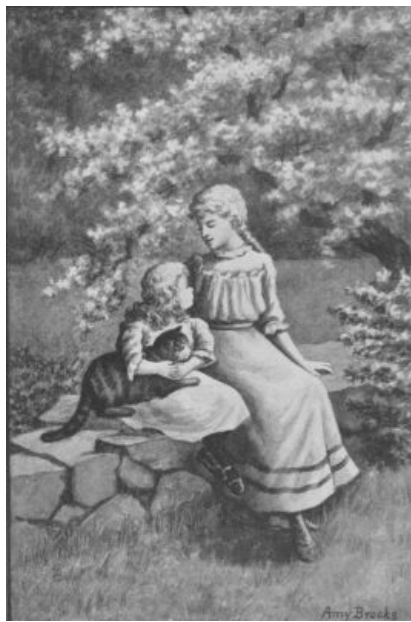
Randy and Prue sat under the shadow of the blossoming branches

The day after Randy's return was bright and sunny, and with little Prue she wandered beneath the sweet scented apple blossoms drinking in their beauty, and wondering if in all the world there was a fairer place than the orchard with its wealth of bloom, when suddenly Prue exclaimed,