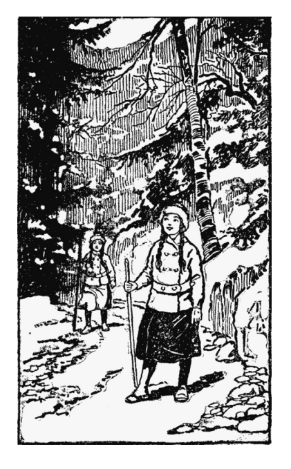
Campfire Girls in the Mountains