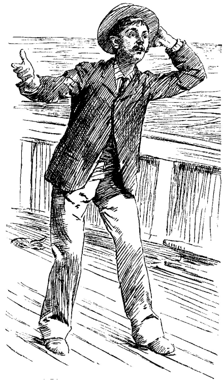
"Pirate,—that's what I was, Sir!"

The Mate (familiarily to the Captain). Yes, dear; you don't want to die in here, do you? ( explanatorily ) "die in"— dine —you'll excuse me , but the ocean always makes me feel so facetious. Captain, dear, if you'll pardon a common sailor like myself for making the suggestion, I beg to call upon you for a song. ( The Captain obligingly bellows "The Stormy