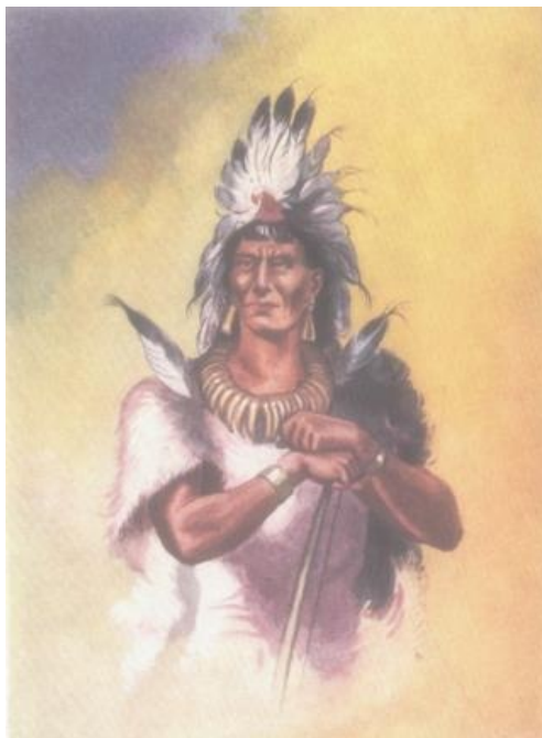
An Indian Brave