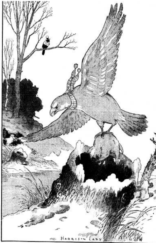
ON BROAD WINGS IT SAILED OVER TO THAT HOLLOW STUMP.

At that very instant Blacky's sharp eyes caught a glimpse of a gray form with broad wings, and in a perfect panic of fear Blacky began to fly as fast as he knew how for a thick spruce-tree not far away. He plunged in among the branches and hid in the thickest part he could find. With little shivers of fear running all over him, he peeked out and watched that big gray form. On broad wings it sailed over to that hollow stump. Two long legs with great curving claws reached down in, and a moment later that fat hen was disappearing over the tree tops. Blacky sighed with relief.