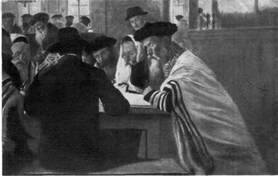
Yeushiva (Talmudical School)

"Now I must return to Lag B'Omer, and tell you what struck me as very strange on that day. As I went with a few of my girl-friends from group to group to see and hear all I could about what was going on, we came to a group of women, girls, and youngsters, and in the centre of them all a lovely little child about three years of age sitting dressed in silk, and a plate near by with some lovely black curls lying on it. I, of course, asked what it all meant, and was told that those people who had only one boy, or who had lost some by death, never cut the hair of their children till they were between three and four years of age. Then, when it was cut, they put all they had cut off upon a scale, and upon the other side of the scale copper, silver, or gold money, according to their means. If poor, they put copper coins upon the scales to test the weight of the hair, and then distributed these copper coins among the poor. In fact, it just looks as if those who receive charity take it in one hand and distribute it with the other.