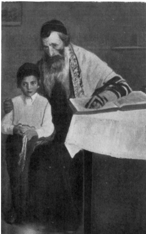
The Father Teaching The Child The Meaning Of The Tsitsith (Sacred Garment)