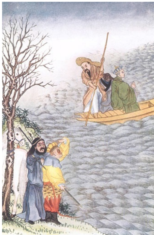
The Demons of Blackwater River Carry Away the Master