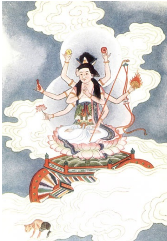
Tou Mu, Goddess of the North Star

because all the other stars revolve round it, and gave her the title of Queen of the Doctrine of Primitive Heaven. Her nine sons have their palaces in the neighbouring stars.