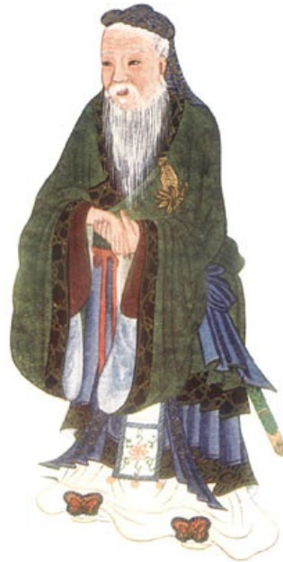
Confucius: Teacher and Philosopher

*** START OF THE PROJECT GUTENBERG EBOOK MYTHS AND LEGENDS OF CHINA ***