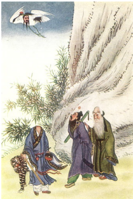
Chiang Tzū-ya at K'un-lun

Tzū-ya said: "My elder brother, since you know all you can pardon him. In the Taoist heart there is no place where mercy cannot be exercised. Remember the many years during which he has faithfully followed the Path."