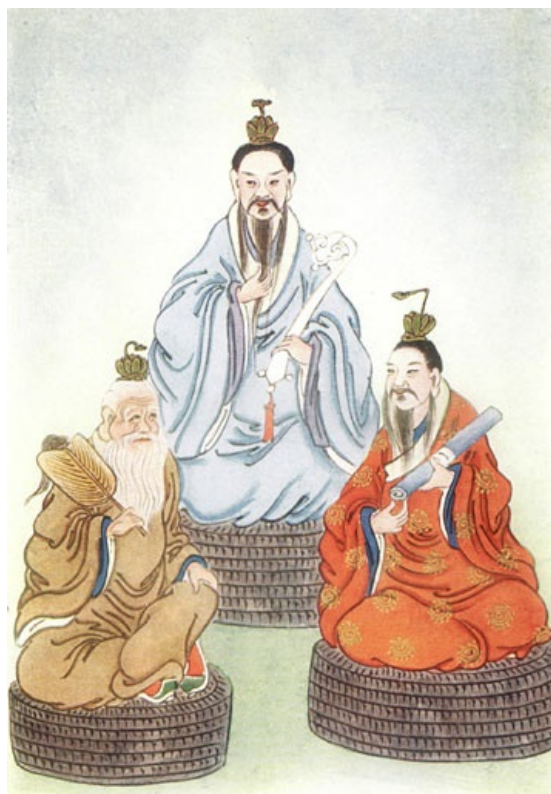
The Taoist Triad

the movements and interaction, or regulates the relations of the yin and the yang , the two great principles of nature.