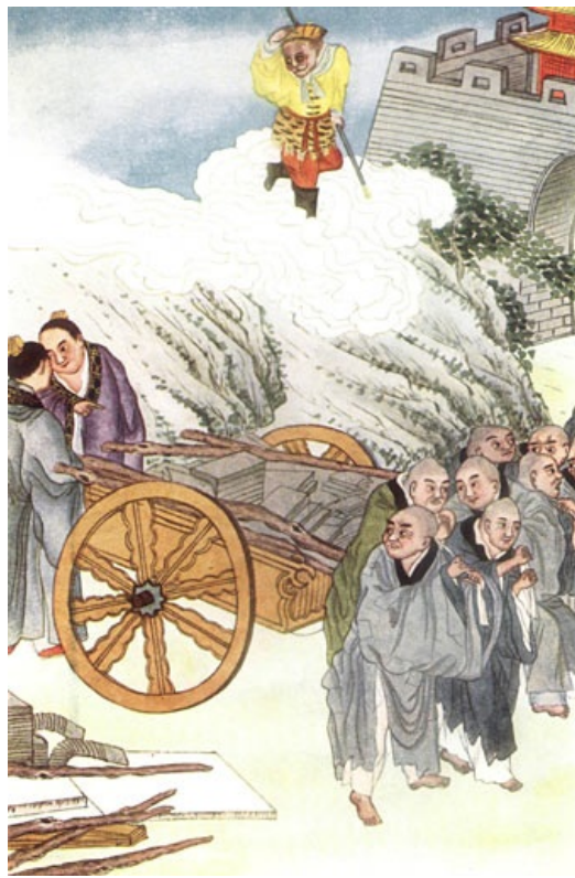
Buddhists As Slaves in Slow-cart Country