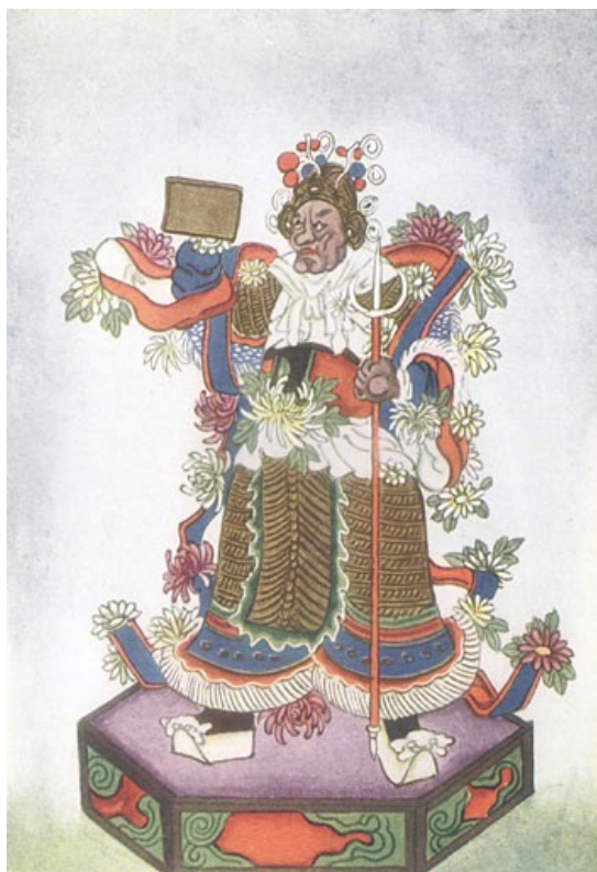
The Spirit That Clears the Way

Of the other chief festivals, about eight in number (not counting the festivals of the four seasons with their equinoxes and solstices), four are specially concerned with the propitiation of the spirits—namely, the Earlier Spirit Festival (fifteenth day of second moon), the Festival of the Tombs (about the third day of the third moon), when graves are put in order and special offerings made to the dead, the Middle Spirit Festival (fifteenth day of seventh moon), and the Later Spirit Festival (fifteenth day of tenth moon). The Dragon-boat Festival (fifth day of fifth moon) is said to have originated as a commemoration of the death of the poet Ch'ü Yüan, who drowned himself in disgust at the official intrigue and corruption of which he was the victim, but the object is the procuring of sufficient rain to ensure a good harvest. It is celebrated by racing with long narrow boats shaped to represent dragons and propelled by scores of rowers, pasting of charms on the doors of dwellings, and eating a special kind of rice-cake, with a liquor as a beverage.