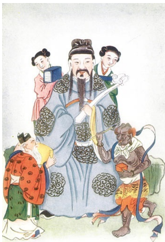
Wên Ch'ang, K'uei Hsing, and Chu I.