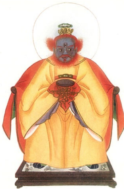
Wên Chung, Minister of Thunder

His origin is ascribed to a man named Wên Chung, generally known as Wên Chung T'ai-shih, 'the Great Teacher Wên Chung,' He was a minister of the tyrant king Chou (1154-1122 B.C.), and fought against the armies of the Chou dynasty. Being defeated, he fled to the mountains of Yen, Yen Shan, where he met Ch'ih Ching-tzu, one of the alleged discoverers of fire, and joined battle with him; the latter, however, flashed his yin-yang mirror at the unicorn, and put it out of action. Lei Chên-tzu, one of Wu Wang's marshals, then struck the animal with his staff, and severed it in twain. Page 199