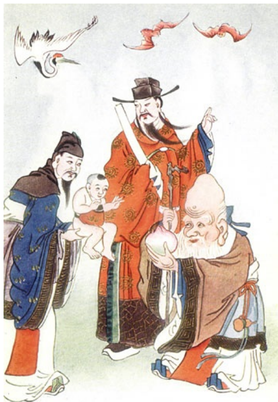
The Gods of Happiness, Office, and Longevity

As with many other Chinese gods, the proto-being of the God of Wealth, Ts'ai Shên, has been ascribed to several persons. The original and best known until later times was Chao Kung-ming. The accounts of him differ also, but the following is the most popular.