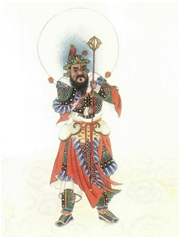
The Door-gods, Civil and Military

Thus it is that Wei Chêng is often associated with the other two Door-gods, sometimes with them, sometimes in place of them. Pictures of these mên shên , elaborately coloured, and renewed at the New Year, are to be seen on almost every door in China.