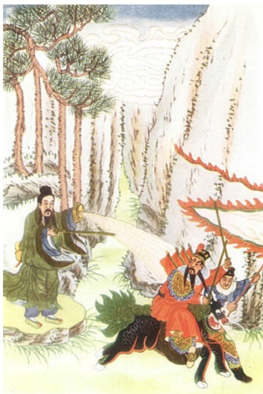
Chiang Tzū-ya Defeats Wên Chung

Thus the stern fight went on, until finally Tzū-ya, under cover of night, attacked Wên Chung's troops simultaneously on all four sides. The noise of slaughter filled the air. Generals and rank and file, lanterns, torches, swords, spears, guns, and daggers were one confused mêlée ; Heaven could scarcely be distinguished from earth, and corpses were piled mountains high.