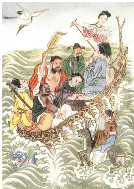
The Eight Immortals Crossing the Sea