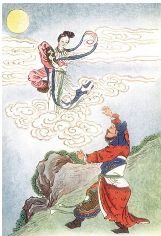
Hêng Ô Flies to the Moon

The young wife, seized with fear, opened the window and flew out. Shên I took his bow and pursued her. The moon was full, the night clear, and he saw his wife flying rapidly in front of him, only about the size of a toad. Just when he was