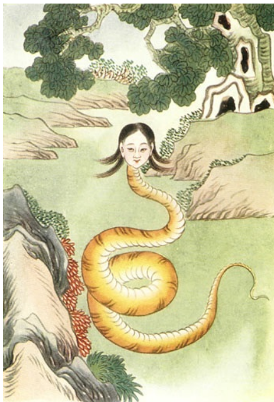
Nü Kua Shih

Heaven-deaf (T'ien-lung) and Earth-dumb (Ti-ya), the two attendants of Wên Ch'ang, the God of Literature (see following chapter), have also been drawn into the cosmogonical net. From their union came the heavens and the earth, mankind, and all living things.