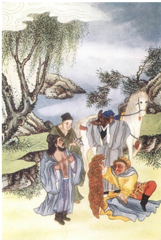
Sun Steals Clothing for His Master

When they had gone a short distance they perceived a great building of fine architecture ahead of them. It proved to be a Taoist temple. Sha Ho-shang said: "Let us enter, for Buddhism and Taoism teach the same things. They differ only in their vestments." The Taoist abbot received them with civility and ordered five cups of tea. Now he was in league with the seven women, and when the servant had made the tea they put poison in each cup. Sun, however, suspected a conspiracy, and did not drink his tea. Seeing that the rest had been poisoned, he went and attacked the sisters, who transformed themselves into huge spiders. They were able to spin ropes instead of webs with which to bind their enemies. But Sun attacked and killed them all.