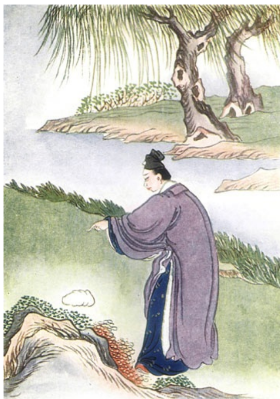
Chia Tzŭ-lung Finds the Stone