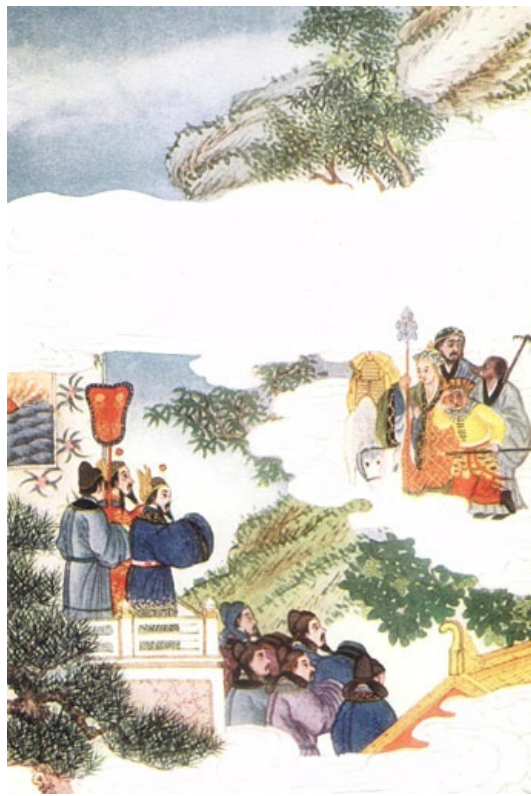
The Return to China

Sun's first thought upon receiving his promotion was to get rid of the Head-splitting Helmet. Accordingly he said to his Master, "Now that I am, like yourself, a Buddha, I want you to relieve my head of the helmet you imposed upon me during the years of my waywardness." Hsüan Chuang replied, "If you have really become a Buddha, your helmet should have disappeared of itself. Are you sure it is still upon your head?" Sun raised his hand, and lo! the helmet was gone.