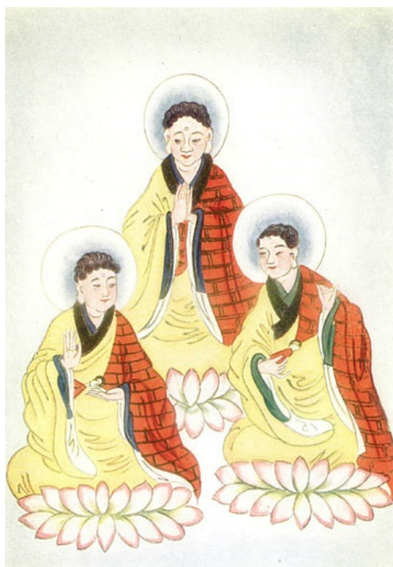
The Buddhist Triad

The principal gods of Buddhism are Jan-têng Fo, the Light-lamp Buddha, Mi-lo Fo (Maitrêya), the expected Messiah of the Buddhists, O-mi-t'o Fo (Amitabha or Amita), the guide who conducts his devotees to the Western Paradise, Yüeh-shih Fo, the Master-physician Buddha, Ta-shih-chih P'u-sa (Mahastama), companion of Amitabha, P'i-lu Fo (Vairochana), the highest of the Threefold Embodiments, Kuan Yin, the Goddess of Mercy, Ti-tsang Wang, the God of Hades, Wei-t'o (Vihârapâla), the Dêva protector of the Law of Buddha and Buddhist temples, the Four Diamond Kings of Heaven, and Bodhidharma, the first of the six Patriarchs of Eastern or Chinese Buddhism.