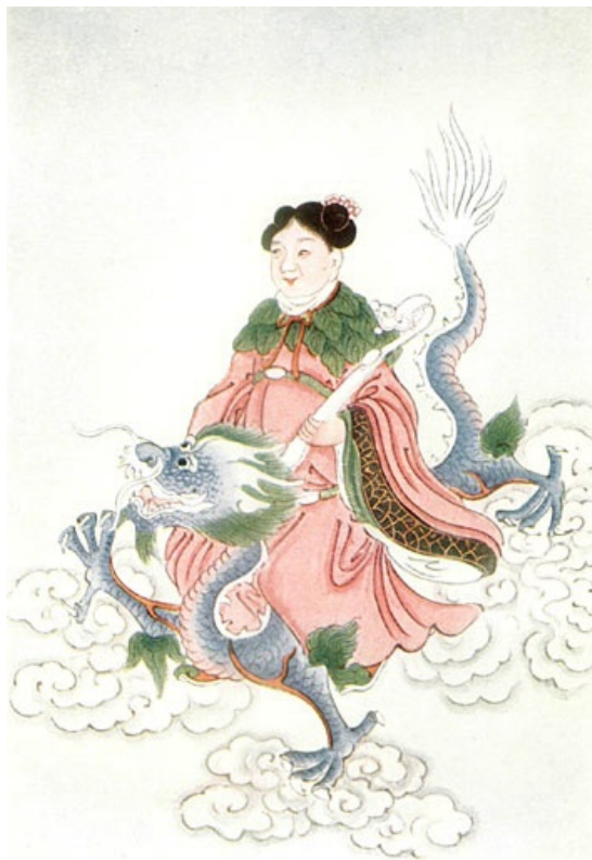
Spirit of the Well