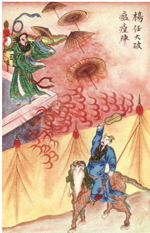
The Magic Umbrellas

to the gods in the event of recovery. The customary offering is five small wheaten loaves, called shao ping , and a pound of meat.