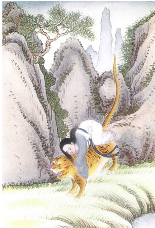
The Tiger Carries Off Miao Shan.

On the day appointed, Commander Hu Pi-li led the condemned Princess to the place of execution. A body of troops had been stationed there to maintain order. The t'u-ti was in attendance at the palace gates. Miao Shan was radiant with joy. "To-day," she said, "I leave the world for a better life. Hasten to take my life, but beware of mutilating my body."