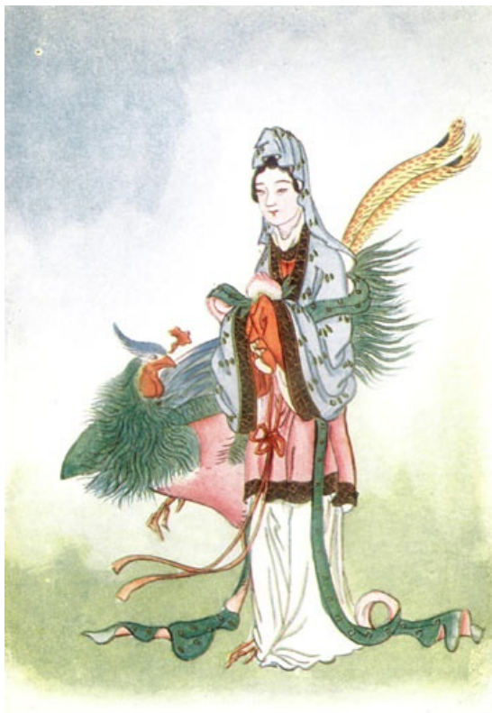
Hsi Wang Mu

As Mu Kung, formed of the Eastern Air, is the active principle of the male air and sovereign of the Eastern Air, so Hsi Wang Mu, born of the Western Air, is the passive or female principle ( yin ) and sovereign of the Western Air. These two principles, co-operating, engender Heaven and earth and all the beings of the universe, and thus become the two principles of life and of the subsistence of all that exists. She is the head of the troop of genii dwelling on the K'un-lun Mountains (the Taoist equivalent of the Buddhist Sumêru), and from time to time holds intercourse with favoured imperial votaries.