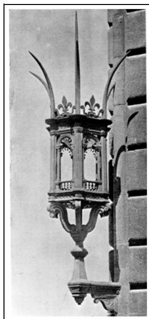
L. WROUGHT IRON LANTERN ON THE PALAZZO GUADAGNI, FLORENCE.

This is one of the finest examples of Italian wrought iron work still existing, and has frequently served as a model for lanterns in recent times.