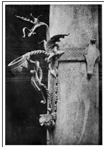
LIII. WROUGHT IRON TORCH HOLDER, PUBLIC SQUARE, SIENA.

This is attached to a column which bears the group representing Romulus and Remus, and which is situated in the public square near the cathedral.