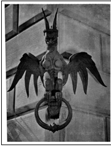
LIV. WROUGHT IRON TORCH HOLDER, SIENA.