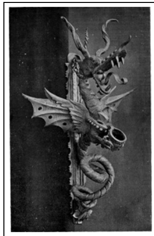
LVI. WROUGHT IRON TORCH HOLDER, SIENA.

These two plates represent the same torch-holder, viewed from front and side.