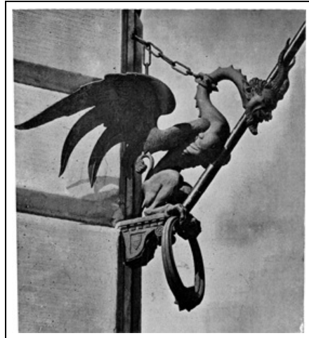
LV. WROUGHT IRON TORCH HOLDER, SIENA.

These two plates represent the same torch-holder, viewed from front and side.