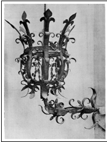
LII. WROUGHT IRON LANTERN ON THE PALAZZO BARONI NEL FILLUNGO, LUCCA.