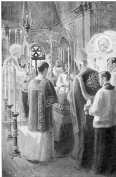
"The Bishop himself stood in cope and mitre to give the last absolution."

[pg 45] The Bishop had loved the Vicar-General—had loved him as a brother. For was it not the Vicar-General who had bidden His Lordship welcome, when he came from his distant parish to take up the cares of a diocese. With all the timidity of a stranger, the Bishop had feared; but the Vicar-General guided his steps safely and well. Now the Bishop, gazing at the white, venerable face, remembered—and wept. In the midst of the Absolution, his voice broke. Priests bit their lips, as their eyes filled with hot tears; but the Sisters who taught in the parochial school and their little charges, did not attempt to keep back their sobs. For others than the Bishop loved the Vicar-General.