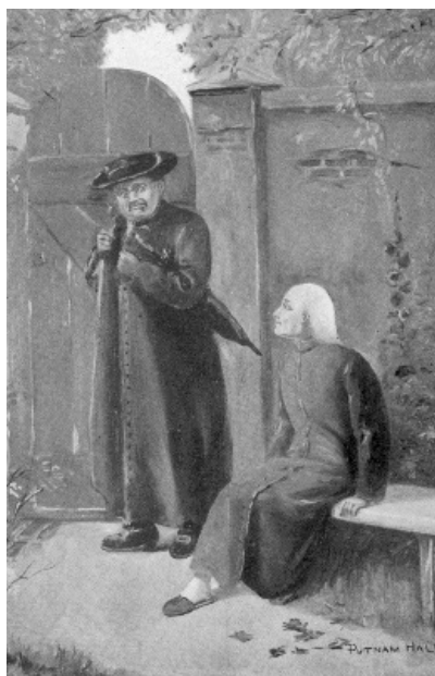
"Mon Dieu! It was mine."

"And the valise? What did you do with it?" asked the hard-hearted Cure of Ste. Agatha, who must have felt sorry that the friend could be so easily duped. "What did you do with the valise?"