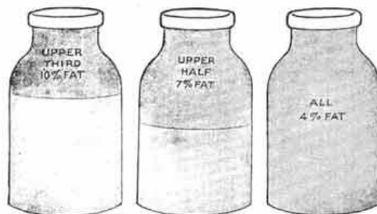
The percentage of fat in the different layers of milk of good average quality.

From a rich Jersey milk, by removing the upper twenty-two ounces, or about two thirds.