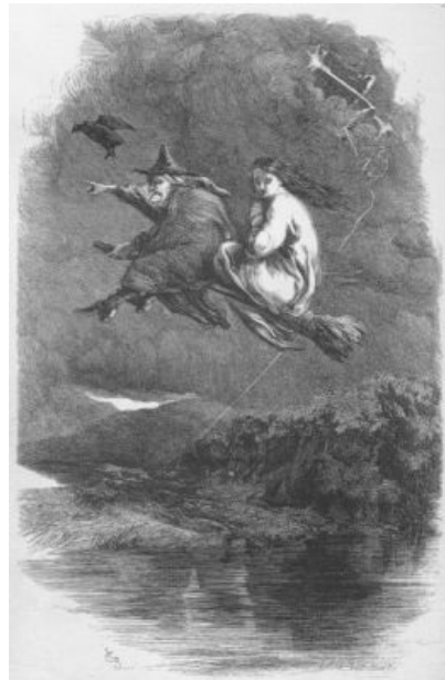
THE RIDE THROUGH THE MURKY AIR.

"Can you not guess?" replied the hag. "I am come to help you, not for any love I bear you, but to avenge myself on old Demdike. Do not interrupt me. My familiar, Fancy, has told me all. I know how you are circumstanced. I know Alizon is in old Demdike's clutches, and you are unable to extricate her. But I can, and will; because if the hateful old hag fails in offering up her sacrifice before the first hour of day, her term will be out, and I shall be rid of her, and reign in her stead. To-morrow she will be on her way to Lancaster Castle. Ha! ha! The dungeon is prepared for her—the stake driven into the ground—the fagots heaped around it. The torch has only to be lighted. Ho! Ho!"