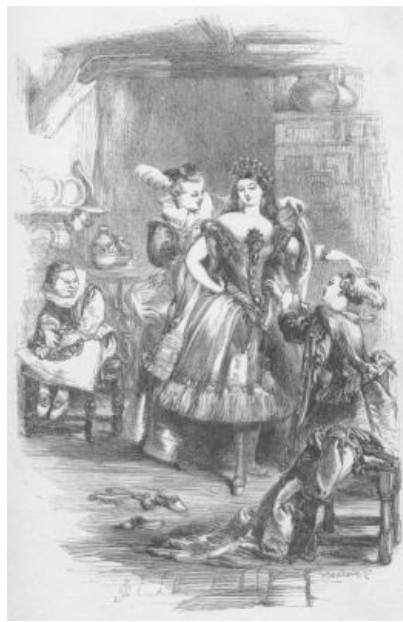
THE MAY QUEEN.

"Weel, sister Alizon, ye may a farrently May Queen, ey mun say" she observed, spitefully, "but to my mind other Suky Worseley, or Nancy Holt, here, would ha' looked prottier."