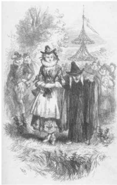
NAN REDFERNE AND MOTHER CHATTOX.

"Master Richard Assheton, o' Middleton," whispered Nan Redferne.