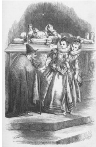
MOTHER CHATTOX, ALIZON, AND DOROTHY.

"I will tell you what has happened, Dorothy," pursued Mother Chattox. "I came hither to Whalley on business of my own; meddling with no one; harming no one. Tread upon the adder and it will bite; and, when molested, I bite like the adder. Your cousin, Nick Assheton, came in my way, called me 'witch,' and menaced me. I cursed him—ha! ha! And then your brother, Richard—"