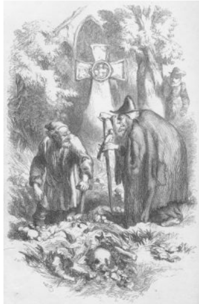
RICHARD OVERHEARS THE MOTHER CHATTOX AND THE SEXTON.

Full of these meditations, he tied his horse to a tree and entered the churchyard, and while pursuing a path shaded by a row of young lime-trees leading to the porch, he perceived at a little distance from him, near the cross erected by Abbot Cliderhow, two persons who attracted his attention. One was the sexton, who was now deep in the grave; and the other an old woman, with her back towards him. Neither had remarked his approach, and, influenced by an unaccountable feeling of curiosity, he stood still to watch their proceedings. Presently, the sexton, who was shovelling out the mould, paused in his task; and the old woman, in a hoarse voice, which seemed familiar to the listener, said, "What hast found, Zachariah?"