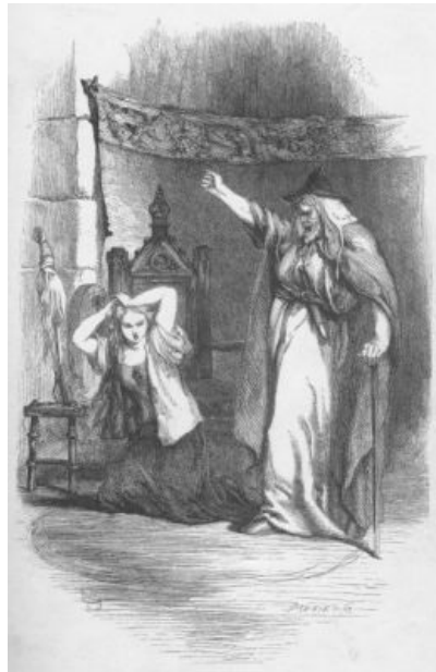
ALIZON ALARMED AT THE APPEARANCE OF MRS. NUTTER.

Advancing on tiptoe she soon discovered a seat, when what was her surprise to find Alizon asleep within it. She was sure it was Alizon—for she had touched her hair and face, and she felt surprised that the contact had not awakened her. Still more surprised did she feel that the young girl had not retired to rest. Again she stepped forward in search of another chair, when a gleam of light suddenly shot from one side of the bed, and the tapestry, masking the entrance to the closet, was slowly drawn aside. From behind it, the next moment, appeared the same female figure, robed in white, that she had previously beheld in the abbot's chamber. The figure held a lamp in one hand, and a small box in the other, and, to her unspeakable horror, disclosed the livid and contorted countenance of Mistress Nutter.