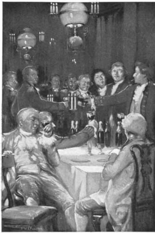
SHE WAS INDEED THE TOAST OF THE ARMY.

She softened from anger to a little laugh of conscious triumph, tapped him with her fan, and sped up the stairs. Her prediction had come true. She was indeed the toast of the army. Her mother apparently saw no scandal in this, being blinded by her own partiality to the royal side. Her father knew it not, for he rarely attended the British festivities, from which he could not in reason debar his wife and daughters. Fanny was too innocent to see harm in what her sister did. But Tom and I, though we never spoke of it to each other, were made sensitive, by our friendship for Philip, to the impropriety of the situation—that the wife of an absent American officer should reign as a beauty among his military enemies. I make no doubt but the circumstance was commented upon, with satirical smiles at the expense of both husband and wife, by the British officers themselves. Indeed I once heard her name mentioned, not as Mrs. Winwood, but as "Captain Winwood's wife," with an expression of voice that made me burn to plant my fist in the leering face of the fellow who spoke—some low-born dog, I'll warrant, who had paid high for his commission.