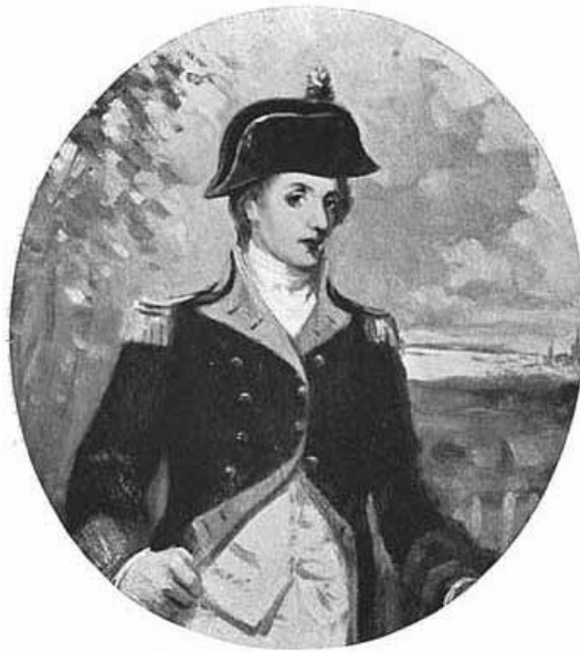
CAPTAIN PHILIP WINWOOD

L.C. PAGE AND COMPANY, Publishers (Incorporated) 212 Summer St., Boston, Mass.