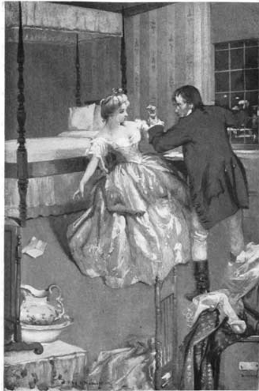
"HE FINALLY DREW BACK TO GIVE HER A MORE EFFECTUAL BLOW."

He stepped forward to lay hands upon the ornaments, which, for their greater security from him, she now wore upon her person at all times. She sprang away, ready to defend them by every possible means, and warning him not to touch her. Her flashing eyes and fiery mien checked him for a moment; then, with a curse, he seized her by the neck and essayed to undo the necklace. Thereupon she screamed loudly for help. To intimidate her into silence, he struck her in the face. At that she began to struggle and hit, so that he was hard put to it to retain hold of her and to save his face from her hands. Enraged by her efforts, he finally drew back to give her a more effectual blow; which he succeeded in doing, but at the cost of relaxing his grasp, so that she slipped from him and escaped by the door. She hastened down the stairs and into the street, he in wrathful pursuit. She fled toward the Strand.