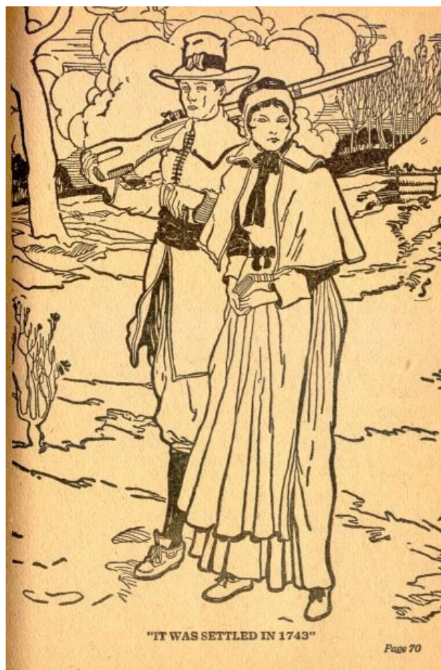
[Illustration: "It was settled in 1743"]

"1743," Ethel repeated, doing some subtraction by the aid of her fingers, for arithmetic was not her strong point. "A hundred and eighty-seven years," she decided after reflection. "Yes, that seems pretty old to me. It's a lot older than Rosemont but over a hundred years younger than Plymouth or Boston."