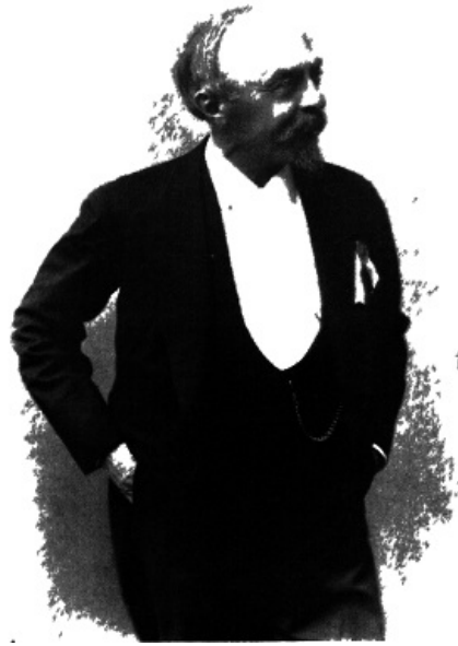
HANS VON BÜLOW

In Von Bülow was found a player of quite a different caliber. Clarity of touch, careful exactness down to the minutest detail caused the critics to call him cold. He was a deep thinker and analyzer; as he played one saw, as though reflected in a mirror, each note, phrase and dynamic mark of expression to be found in the work. From a Rubinstein recital the listener came away subdued, awed, inspired, uplifted, but disinclined to open the piano or touch the keys that had been made to burn and scintillate under those wonderful hands. After hearing Von Bülow, on the other hand, the impulse was to hasten to the instrument and reproduce what had just seemed so clear and logical, so simple and attainable. It did not seem to be such a difficult thing to play the piano—like that! It was as though he had said: "Any of you can do what I am doing, if you will give the same amount of time and study to it that I have done. Listen and I will teach you!"