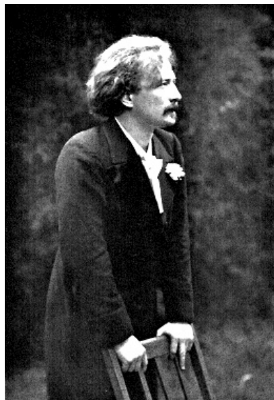
IGNACE JAN PADEREWSKI