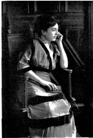
With sincerest good wishes Fannie Bloomfield Zeisler Chicago Dec 30 '14

Each year, as Mme. Bloomfield Zeisler plays for us, we feel the growth of a deeper experience, a clearer insight into human nature, a broader outlook and grasp on art and life. Such a mentality, ever seeking for truth and the sincerest expression of it, must continually progress, until—as now—the greatest heights are reached. Mme. Zeisler is no keyboard dreamer, no rhapsodist on Art. She is a thoroughly practical musician, able to explain as well as demonstrate, able to talk as well as play. Out of the fulness of a rich experience, out of the depth of deepest sincerity and conviction the artist speaks, as she plays, with authority and enthusiasm.