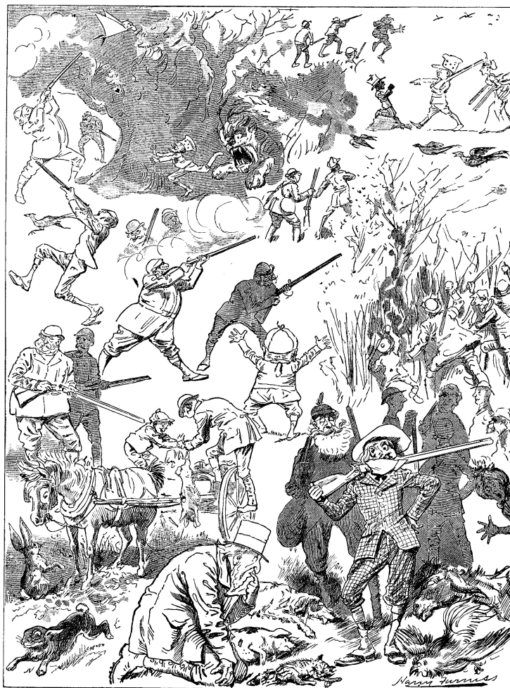
MR. PUNCH'S SHOOTING-PARTY.