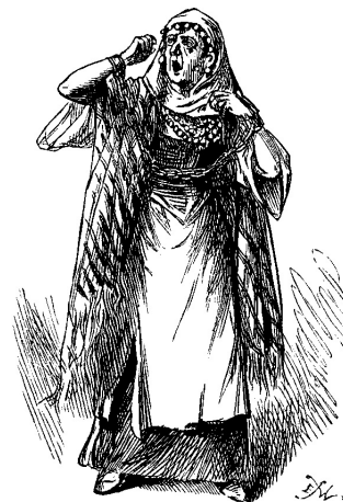
"Azucena," or, "My pretty Chain!"

SCENE 2.— Leonora , and Manrico are about to be married; everything prepared—four apathetic bridesmaids, and the four acolytes in tights—who have possibly been kindly lent by the Convent for the occasion—in a vacuous row at the back of the scene. Fancy Manrico has forgotten to give them the usual initial brooches, and they feel the wedding is a poky affair, and take no interest in it. Leonora herself is in low spirits—seems to miss the confidant, and to be oppressed with a misgiving that the wedding is not destined to come off. Misgivings on the stage are never thrown away—the wedding is interrupted immediately by a crowd of men, in small sugar-loaf caps, who carry the bridegroom off to fight—whereupon, of course, the Curtain falls.