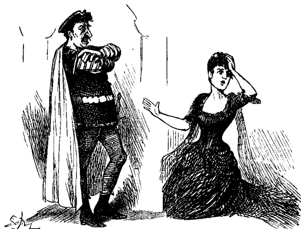
Luna and the Star of the Evening.

ACT IV. SCENE 1.— Leonora listening outside the tower in which Manrico is being tortured, after having been taken prisoner in a combat during the entr'acte . Here a confidant might have comforted her considerably by representing that they couldn't be torturing the poor Troubadour so very seriously so long as he is able to take part in a duet—but unfortunately Leonora seems to have discharged the confidant after the Second Act—an error of judgment on her part, for she is certainly incapable of taking care of herself. A cool-headed, sensible confidant, for instance, would have taken care that the bargain with the Conte di Luna was conceived and carried out in a more business-like spirit.