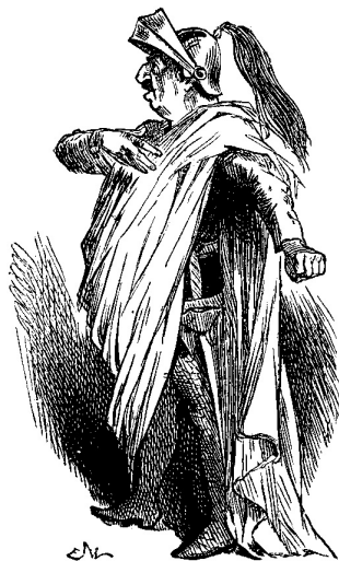
Manrico, a rather full-blown "Ghost in Hamlet."

SCENE 2.—The Cloisters of a Convent. Enter the Conte di Luna , with followers, to abduct Leonora . The followers range themselves against a wall in the background, until the Count has finished " Il Balen ." If their opinion was asked, they would probably be in favour of his making rather less noise about it, if he really means business—but of course it is not their place to interfere. Leonora enters to take the veil, with procession of nuns, preceded by four female acolytes—or are they pages?—in white tights, carrying tapers. The Count and his followers are evidently a little taken aback—an abduction not quite so simple an affair as they expected. While they are working themselves up to it, Manrico appears, as the stage-direction says, "like a phantom." In a helmet, with a horsehair tail, and a large white cloak, he does look extremely like the Ghost in Hamlet , and which is, perhaps, why the Count, under the impression that he is an apparition from some other Opera, allows him to Walk off with Leonora under his very nose. Swords are drawn—with the usual result of bringing down the Curtain.