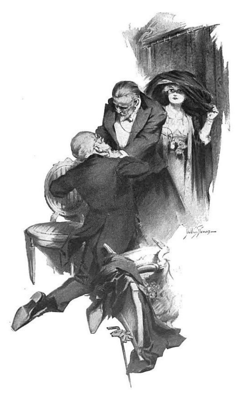
Had she taken sides with either of them, with a single movement, the victory would have been decided in that one's favor. Frontispiece