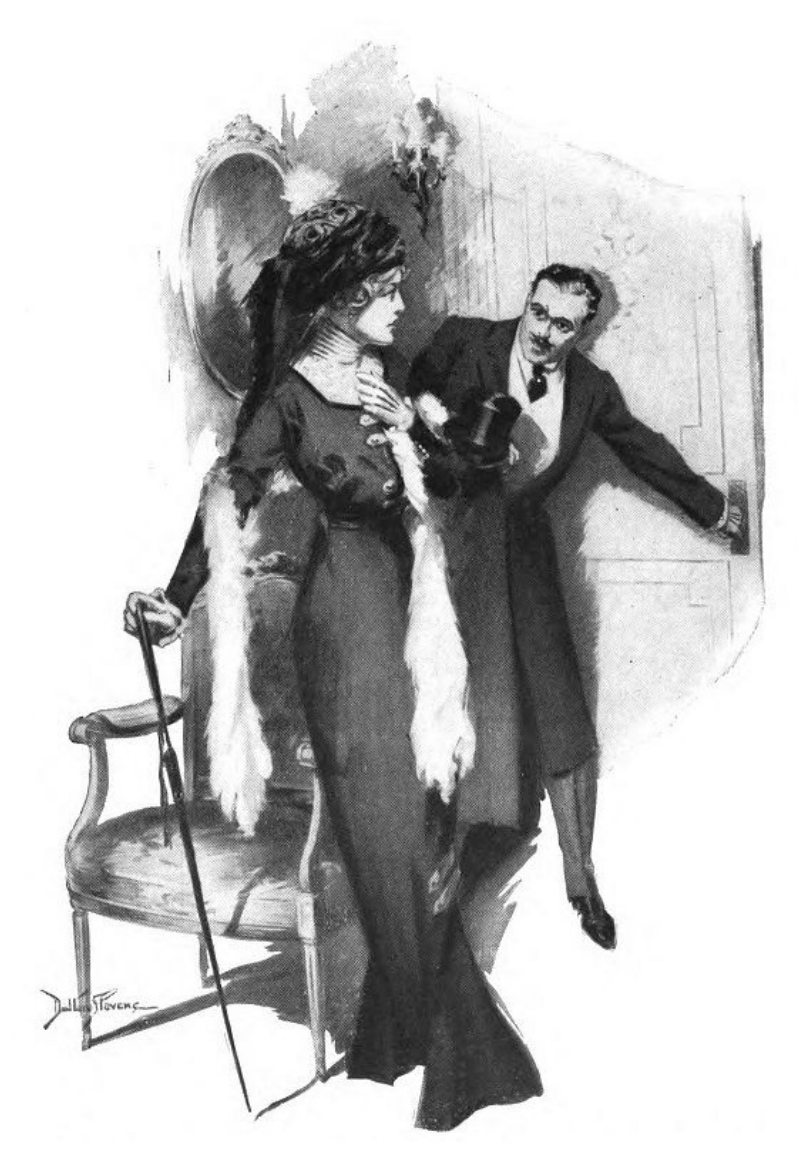
"What we have to do is to stop the mischief and to-night, you understand, to-night the thing will be done."

flat, when a cry escaped him: Clarisse stood before him; Clarisse, who had returned from Brittany at the moment of the verdict.