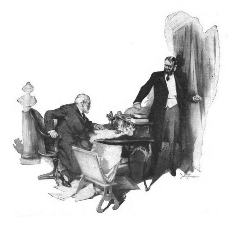
Lupin sprang to his feet. He was prepared for every upshot except this.

Lupin sprang to his feet. He was prepared for everything but this. Yet something within him stronger than astonishment, an impulse of his whole nature, made him say, with a laugh: