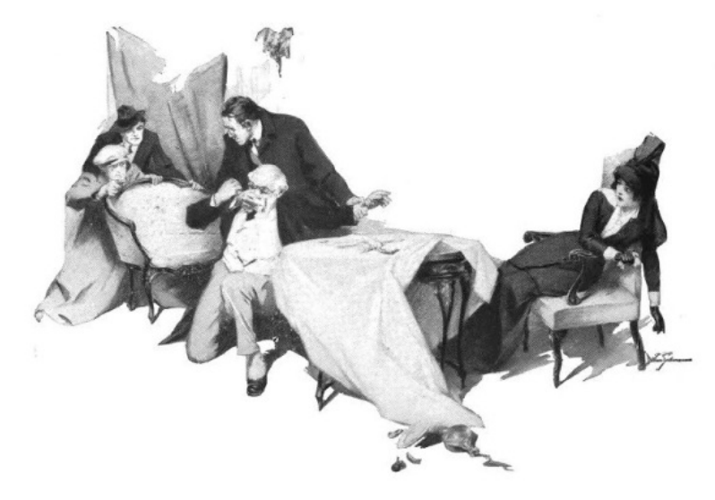
The sight which she beheld struck her with stupefaction.

The sight which she beheld struck her with stupefaction. Instead of the grinning features which she expected to see, she saw a motionless, unrecognizable face, contorted by an expression of unspeakable terror: and the eyes, invisible under the double impediment of the spectacles, seemed to be staring above her head, above the chair in which she lay prostrate.