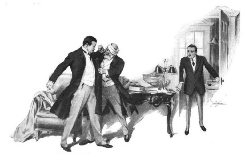
Daubrecq ran up to Prasville out of breath and caught hold of him with his two enormous hands.

"Daubrecq!" exclaimed Prasville, in bewilderment. "Daubrecq here! Show him in."