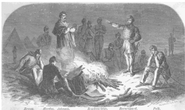
COUNCIL OF WAR BEFORE THE BATTLE OF PITTSBURG LANDING. (Page 145.)

*** START OF THE PROJECT GUTENBERG EBOOK THIRTEEN MONTHS IN THE REBEL ARMY ***