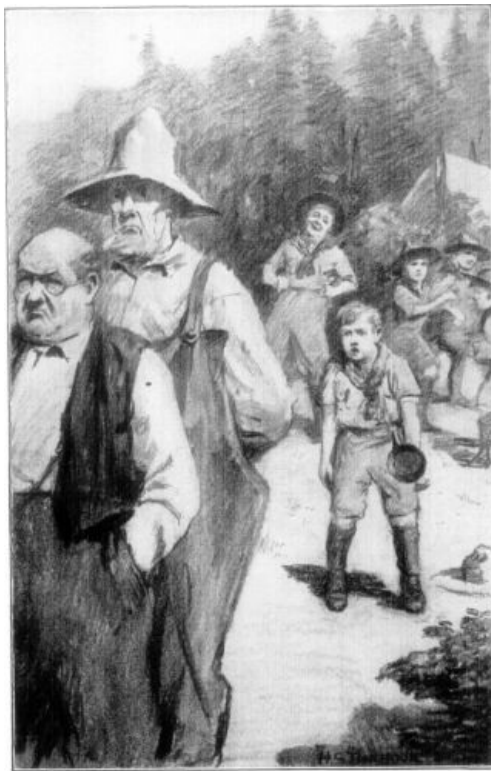
"WE'RE NOT MINERS, WE'RE SCOUTS!"