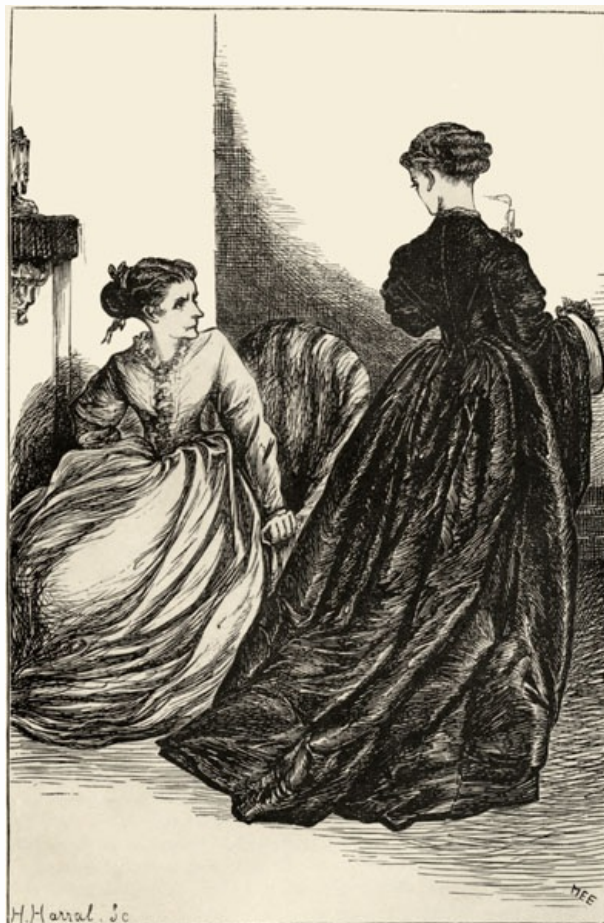
HOW DAMON PARTED FROM PYTHIAS.

"I will have no more of your Julie; and I will have no more of you." As she said this she rose from her chair, and walked about the room. "You have betrayed me, and there shall be an end of it."