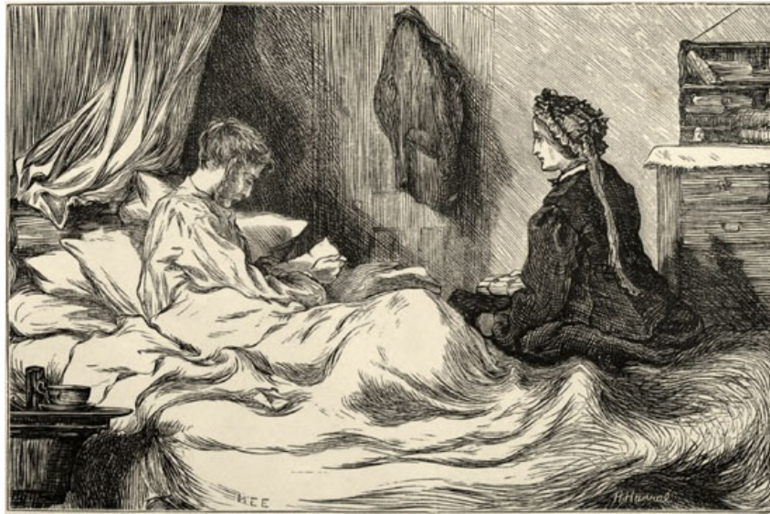
THE SHEEP RETURNS TO THE FOLD.