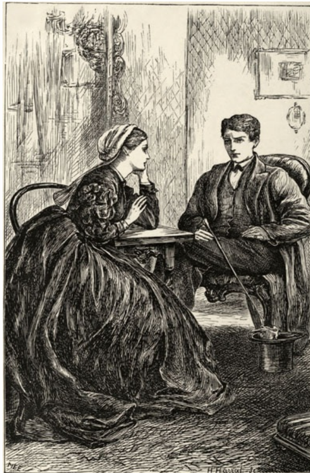
A FRIENDLY TALK.

"Does it not seem odd, Harry, that you and I should be sitting, talking together in this way?" She was leaning now towards him, across the table, and one hand was raised to her forehead while her eyes were fixed intently upon his. The attitude was one which he felt to express extreme intimacy. She would not have sat in that way, pressing back her hair from her brow, with all appearance of widowhood banished from her face, in the presence of any but a dear and close friend. He did not think of this, but he felt that it was so, almost by instinct. "I have such a tale to tell you," she said; "such a tale!"