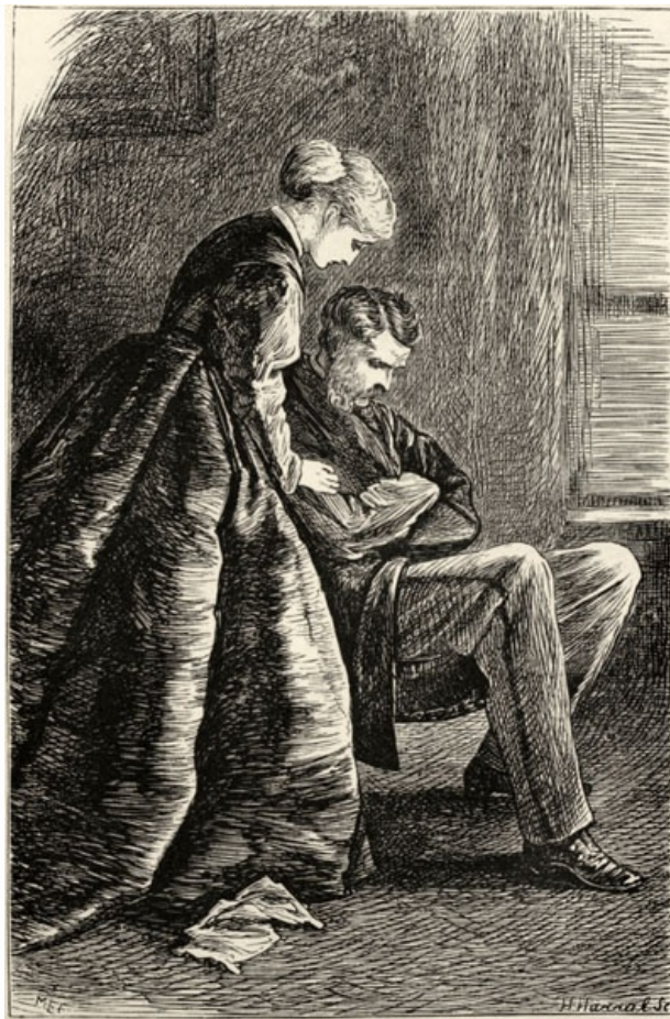
"THE LORD GIVETH, AND THE LORD TAKETH AWAY."