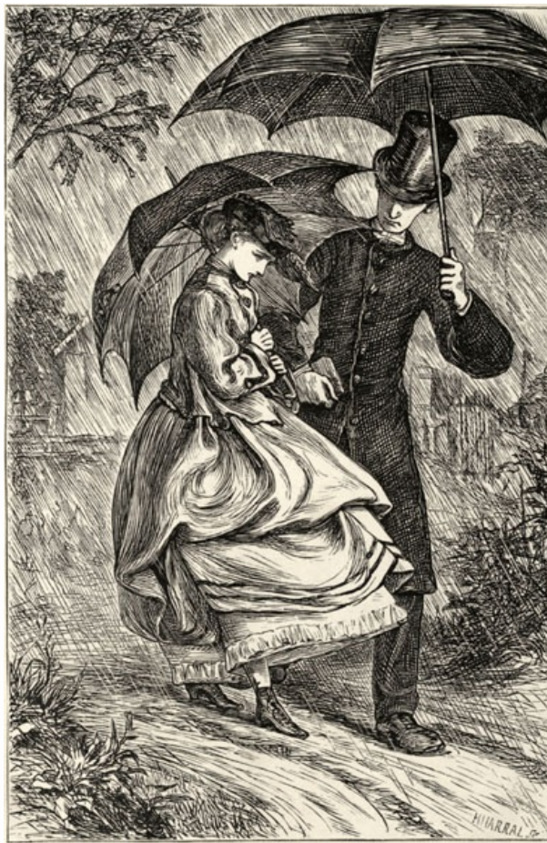
MR. SAUL PROPOSES. Click to ENLARGE

He had not spoken altogether amiss, and Fanny, though she was very angry with him, was conscious of this. The time he had chosen might not be considered suitable for a declaration of love, nor the place; but having chosen them, he had, perhaps, made the best of them. There had been no hesitation in his voice, and his words had been perfectly audible.