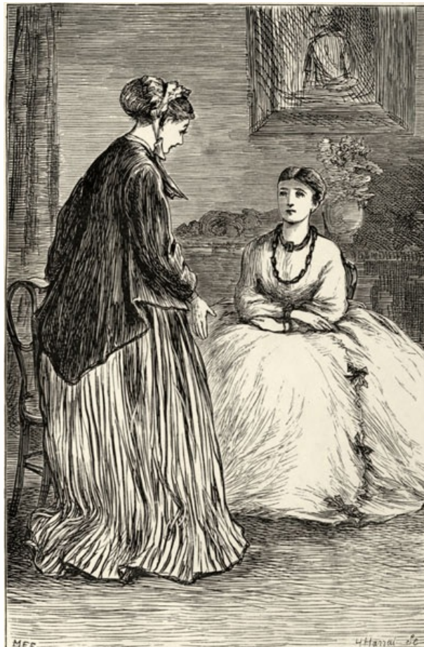
A PLEA FOR MERCY.

"For mercy and forbearance," said Mrs. Burton, rising from her seat and coming over to the side of the room in which Lady Ongar was seated.