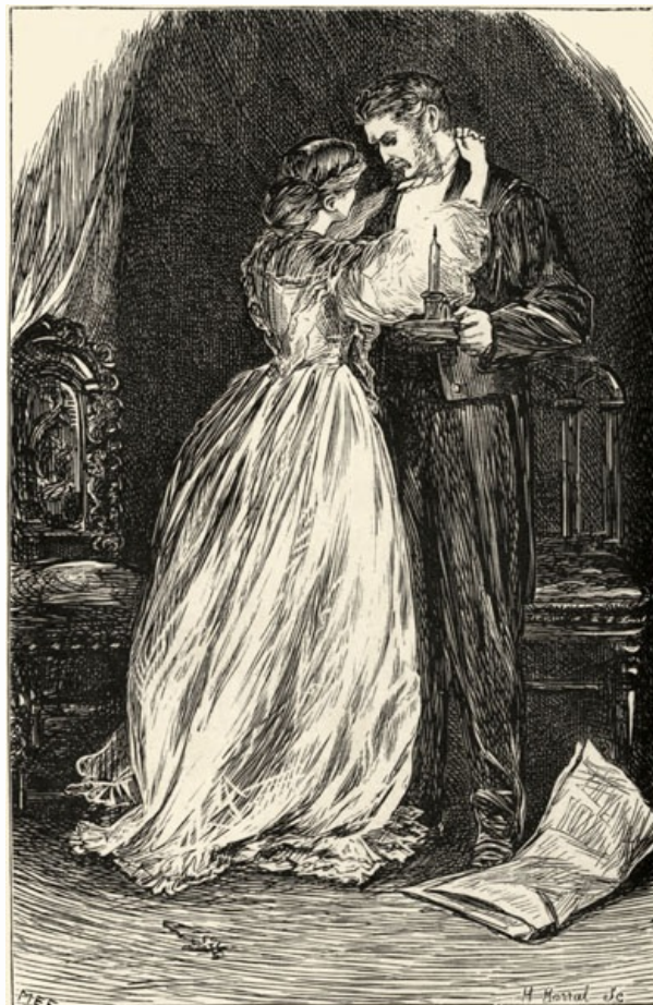
HUSBAND AND WIFE. Click to ENLARGE

"All right," he said. His position with the candle was awkward, and he wished that it might be over.