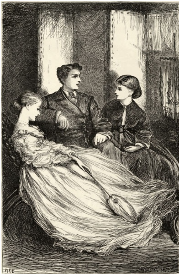
HARRY SAT BETWEEN THEM, LIKE A SHEEP AS HE WAS, VERY MEEKLY.