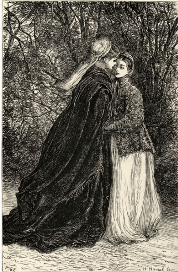
LADY ONGAR AND FLORENCE.