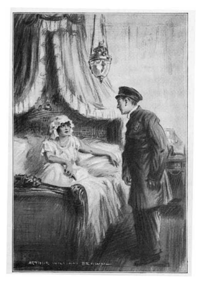
"You're the one woman in a thousand who knows enough to look before she shoots!"

Quite naturally he drew a braided blue cuff across a beaded forehead.