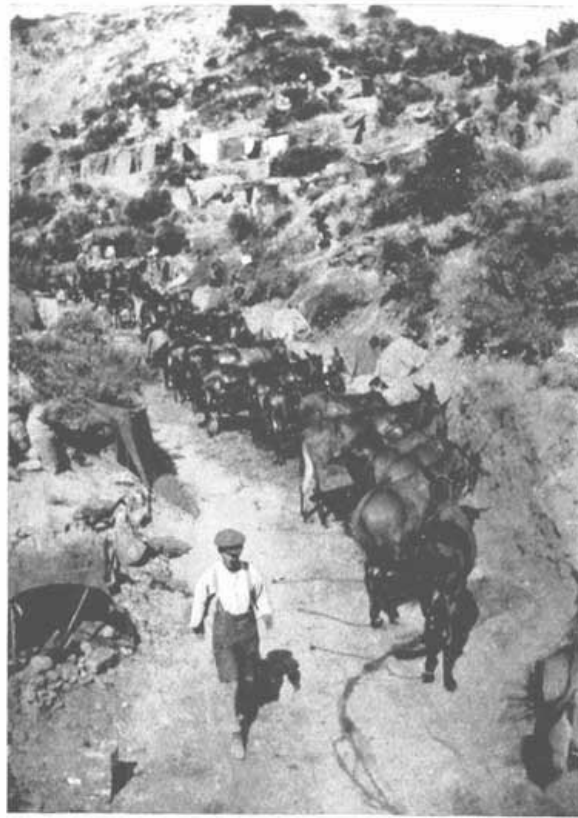
Mules in a Gully.