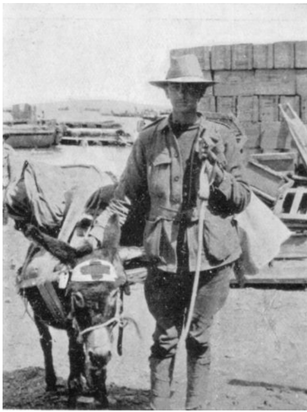
Simpson and his Donkey