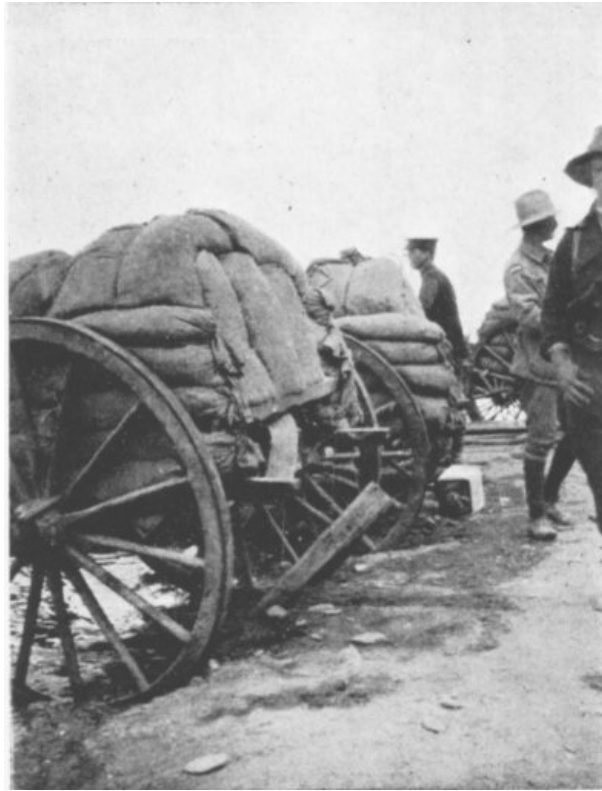
Water Carts protected by Sand Bags