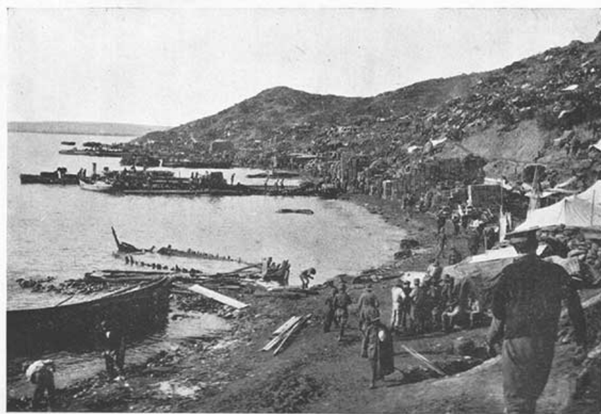
ANZAC COVE.

*** START OF THE PROJECT GUTENBERG EBOOK FIVE MONTHS AT ANZAC ***