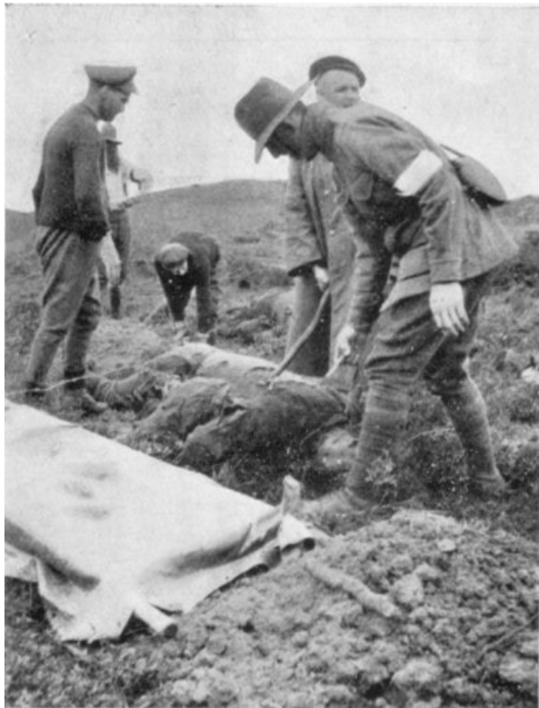
Burial Parties during the Armistice.