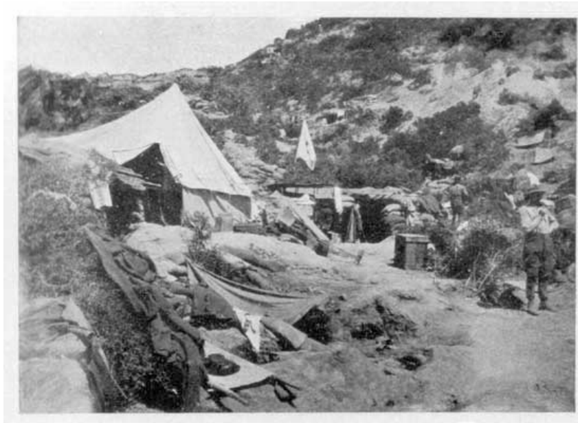
4th Field Ambulance in Head Quarters Gully.