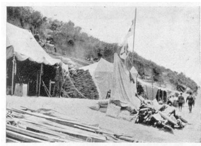
4th Field Ambulance Dressing Station on the beach.