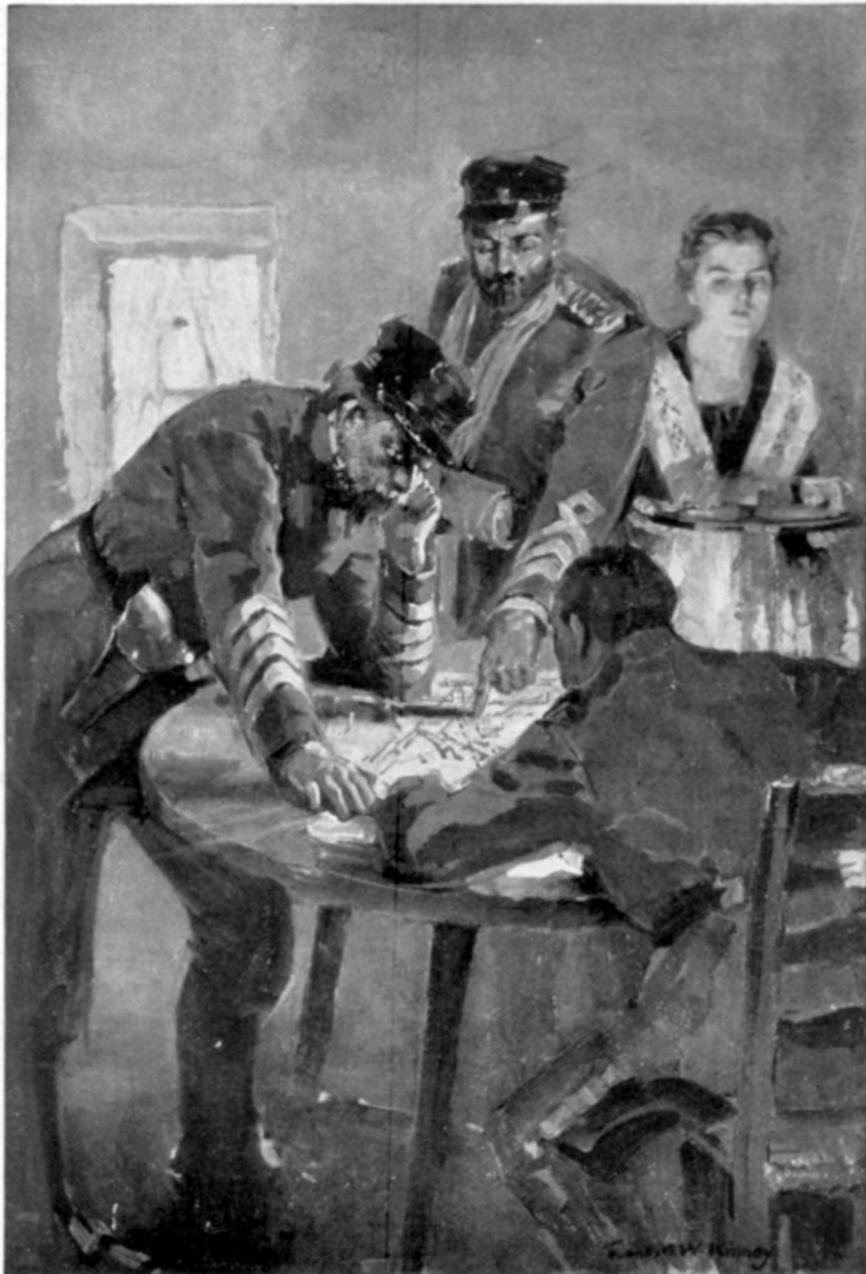
Officers stopping in to fight their paper and pin battles.