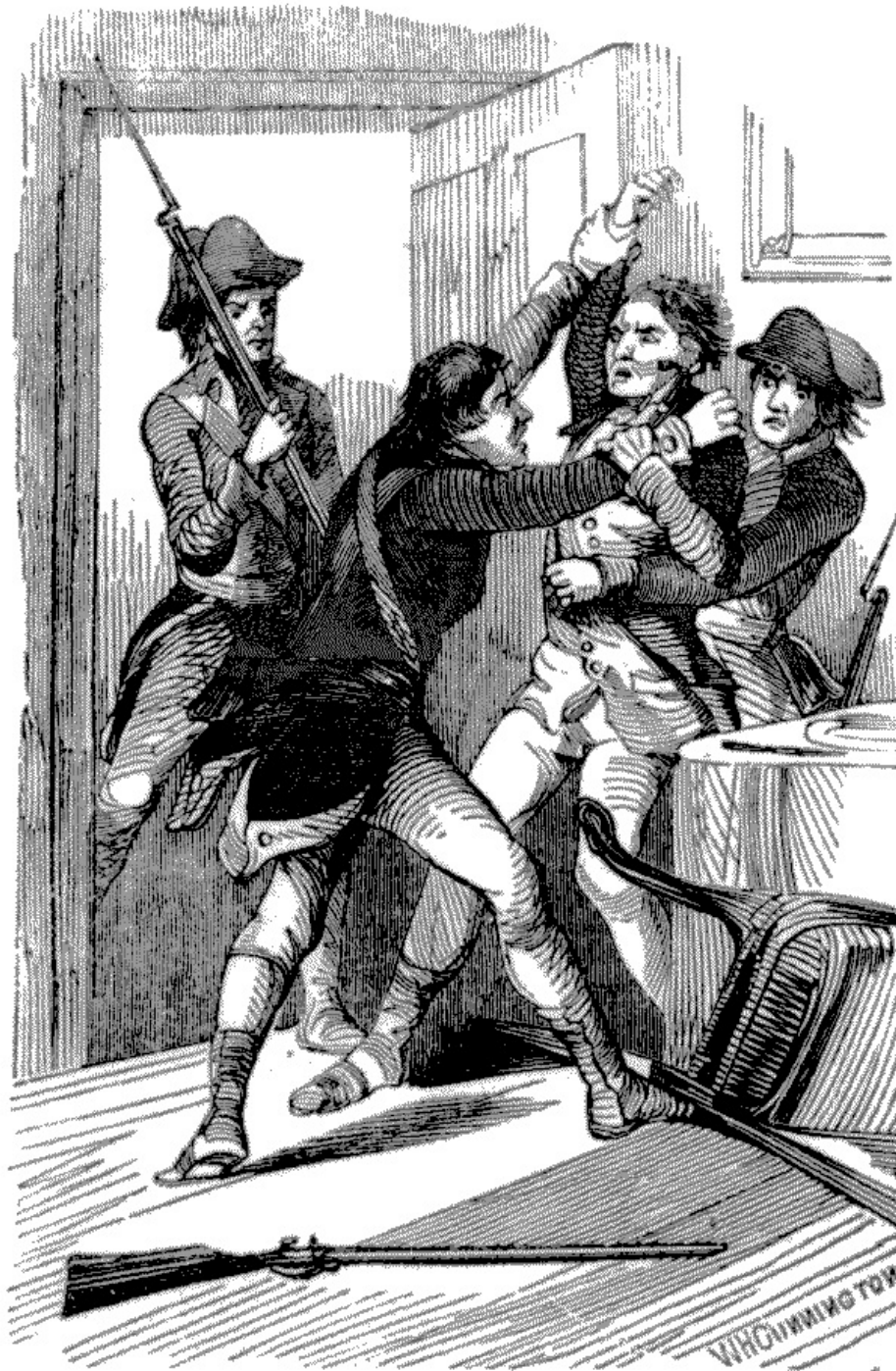
SEIZURE OF THE BETTYS.

"Did this affair happen before that of André's?" enquired Hand. "If so, these men only imitated the noble example of Paulding, Williams and Van Wert."