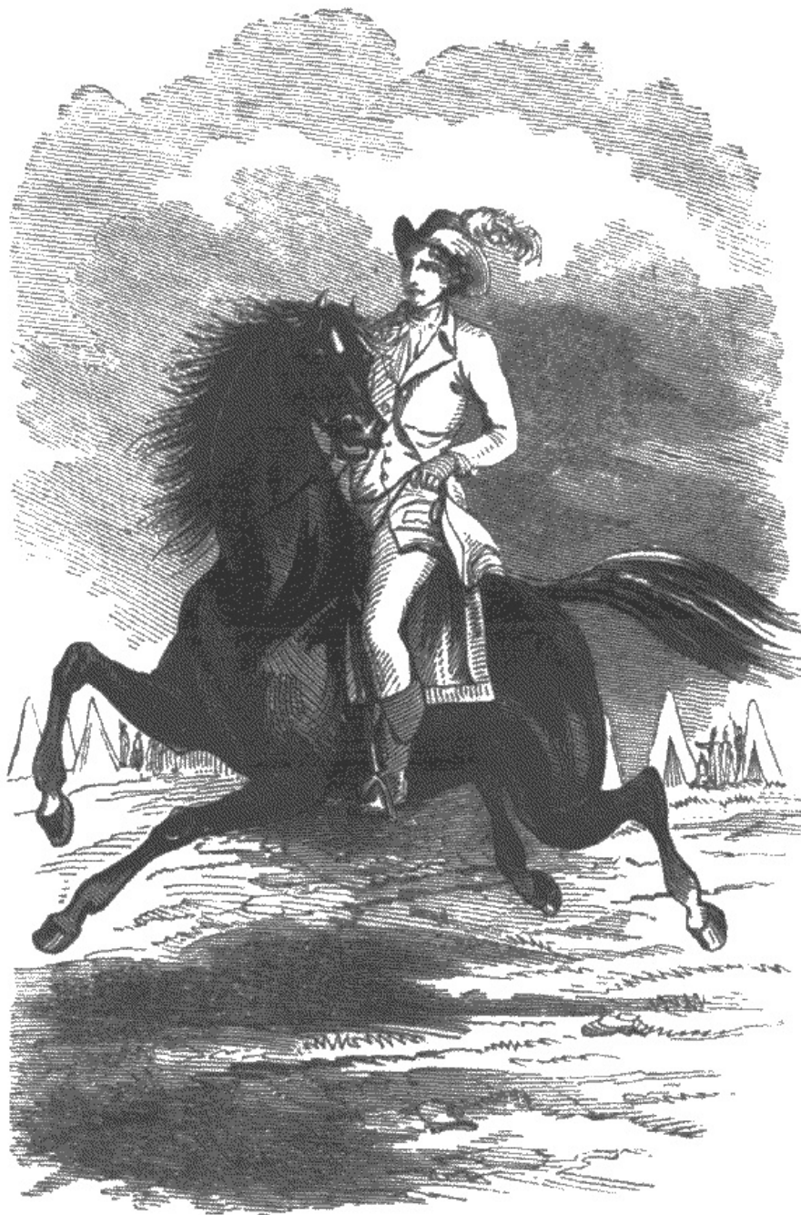
TARLETON BREAKING THE HORSE.

"At length, exhausted from the conflict, Tarleton drew up before his tent and threw himself from his saddle. The horse was completely subdued, and at the word of command followed him like a dog. The victory was complete. His eye of fire was dim and lustreless—drops of agony fell from his drooping front, while from his labouring and mangled sides the mingled blood and foam poured in a thick and clotted stream. Tarleton himself was pale as death, and as soon as he was satisfied with his success, retired and threw himself on his couch. In a short time I was called into his presence and delivered my despatches. Immediate orders were issued to make preparation for a return to Hillsborough, so soon as all the scouts had come in; and the next morning early found us again beyond the Haw River—and in good time, too, for as the last files were emerging from the stream, the advance of Lee's Legion appeared on the opposite bank, and, with a shout of disappointed rage, poured a volley into the ranks of the retreating columns.