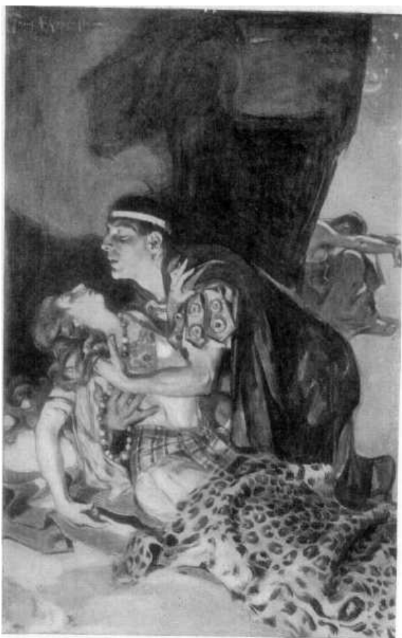
Philadelphus looked down upon his prize.

Julian made a sharp menacing sound, and with clenched hands rose on his knees. But Philadelphus looked at him steadily, half-amused at the implied threat, half-inviting its fulfilment, and under his gaze, Julian rose slowly and drew away. Philadelphus tossed the coin after him. His cousin picked it up and put it in his purse.