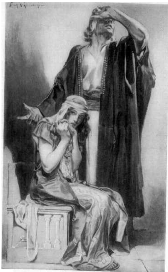
"And there His enemies crucified Him."

thee; and they shall not leave in thee one stone upon another; because thou knewest not the time of thy visitation.