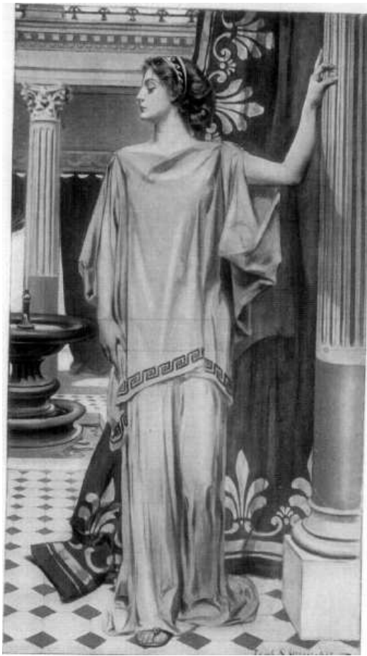
Amaryllis the Greek.

She turned toward the arch which led into the interior of the house. The pretender glanced again at Laodice and again at the Greek.