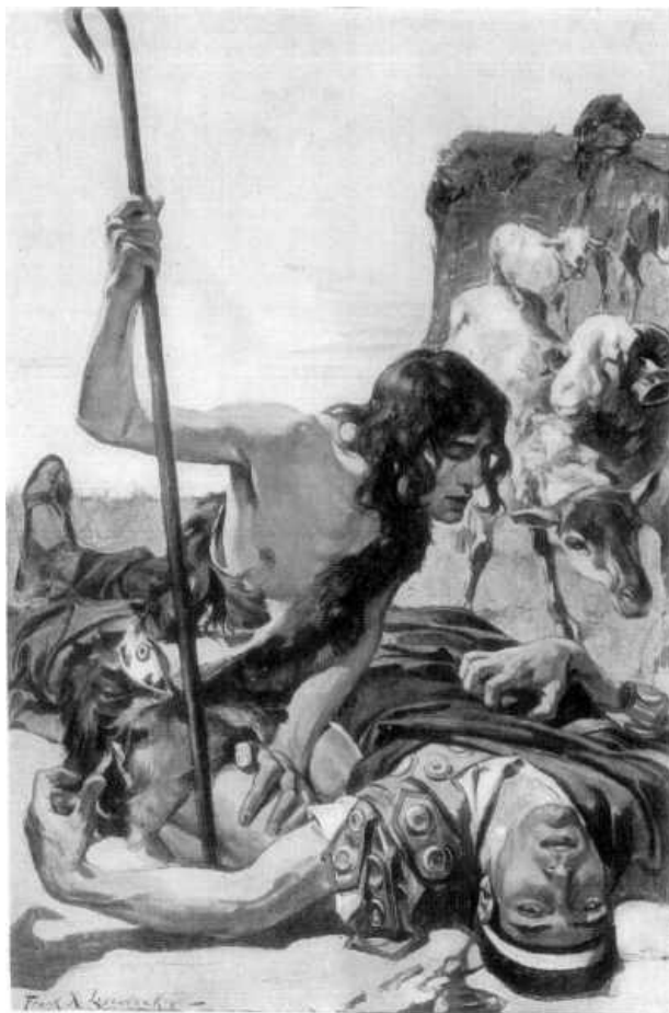
He threw himself down by the still figure.

" I was sick and ye visited me, " he whispered radiantly.