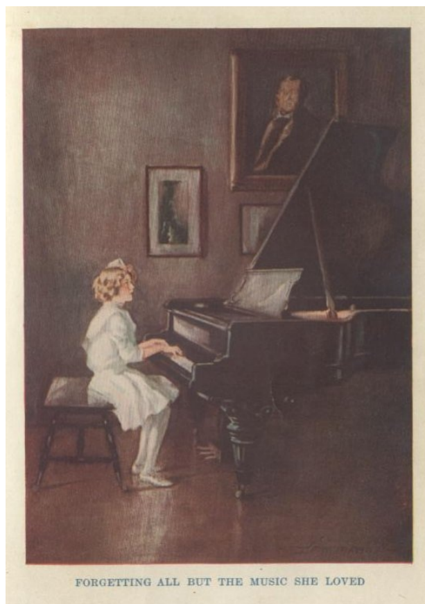
FORGETTING ALL BUT THE MUSIC SHE LOVED