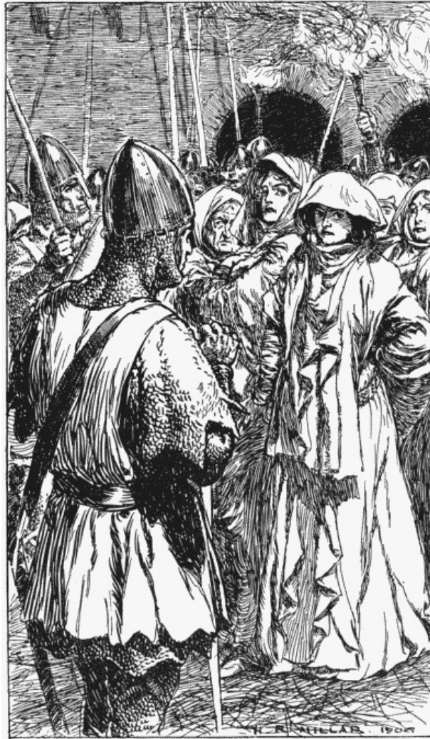
'At this she cried that I was a Norman thief'

the Beacon of Brunanburgh behind us here, south and north it ran a full league—and all the woods were full of broken men from Santlache, Saxon thieves, Norman plunderers, robbers, and deer-stealers. A hornets' nest indeed! [47]