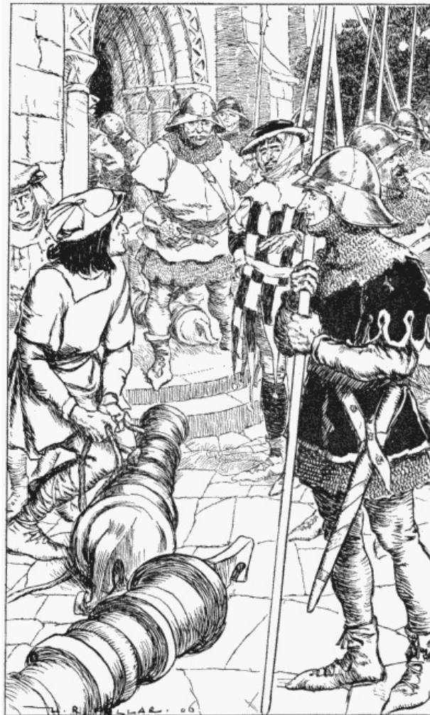
'I reckon you'll find her middlin' heavy, he says.' [248]

'But John Collins was our masterpiece! He happened along-street (his jaw tied up where