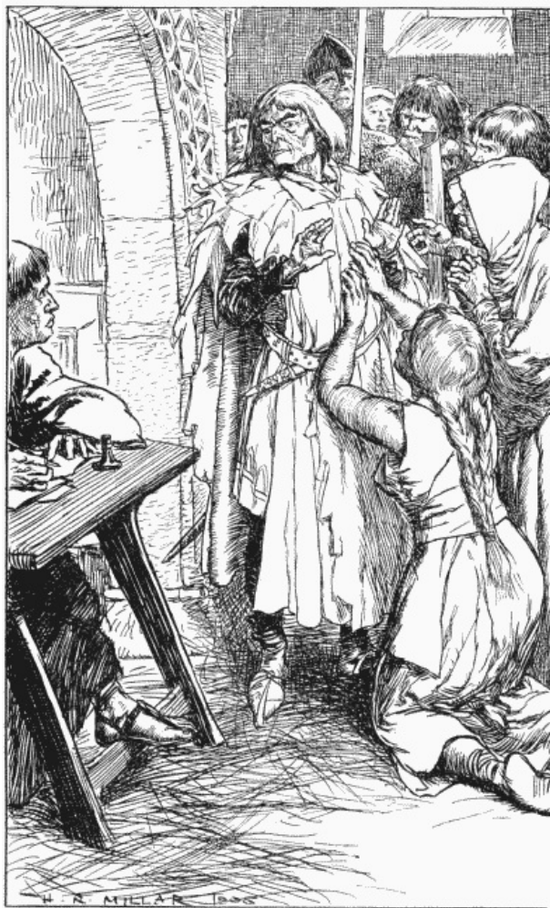
'A' God's name write her free, before she deafens me!'

our work!" He clapped the man-at-arms that was Jehan's nephew on the shoulder, and kissed the wench, and fretted with his feet among the rushes to show it was finished. (The Great Hall is always bitter cold.) I stood at his side; Hugh was behind Gilbert in the fireplace making to play with wise rough Odo. He signed to De Aquila, who bade Gilbert measure the new field for the new couple. Out then runs our Gilbert between man and maid, his beads clashing at his waist, and the Hall being empty, we three sit by the fire. [115]