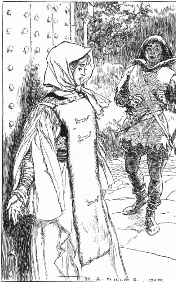
'Sir Richard, will it please you to enter your Great Hall?'

'Aye, she was sorry, and she said so,' said Sir Richard, coming back with a little start. 'Very soon—but he said it was two full hours later—De Aquila rode to the door, with his shield new scoured (Hugh had cleansed it), and demanded entertainment, and called me a false knight, that would starve his overlord to death. Then Hugh