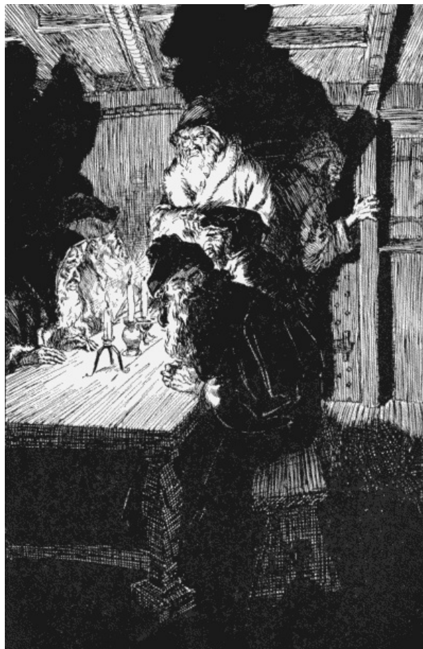
Doors shut, candle lit.

thinking of King John's reign,' he explained. 'His people were badly treated then.'