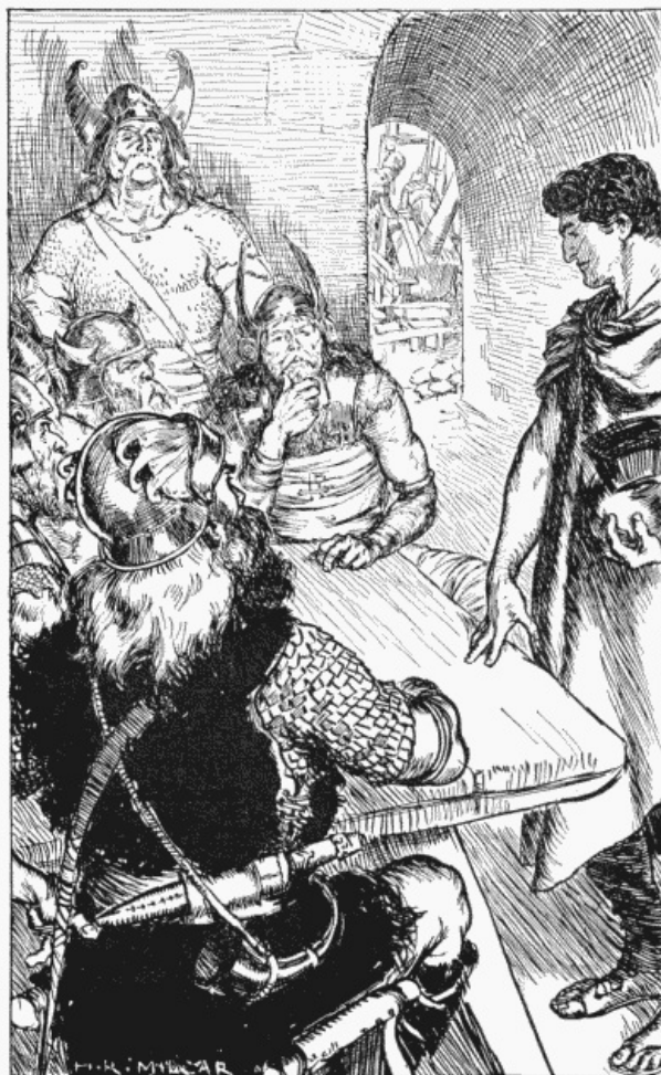
'The Wall must be won at a price.'

'And Pertinax read on: " You gave me the time for which I asked. If I have failed to use it, do not lament. We have gambled very splendidly against the Gods, but they hold weighted dice, and I must pay the forfeit. Remember, I have been; but Rome is; and Rome will be. Tell Pertinax his Mother is in safety at Nicaea, and her monies are in charge of the Prefect at Antipolis. Make my remembrances to your Father and to your Mother, whose friendship was great gain to me. Give also to my little Picts and to the Winged Hats such messages as their thick heads can understand. I would have sent you three Legions this very day if all had gone aright. Do not forget me. We have worked together. Farewell! Farewell! Farewell! " [217]