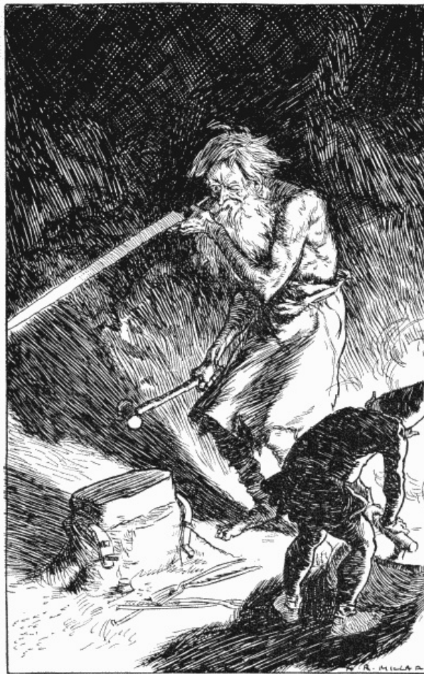
Then he made a sword

attacked by the French. The novice came first of all, waving his new sword and shouting Saxon battle-cries. When they saw the shoeing-tools they were very bewildered, till the novice asked leave to speak, and told what he had done to the farmer, and what he had said to Wayland-Smith, and how, though the dormitory light was burning, he had found the wonderful rune-carved sword in his cot. [27]