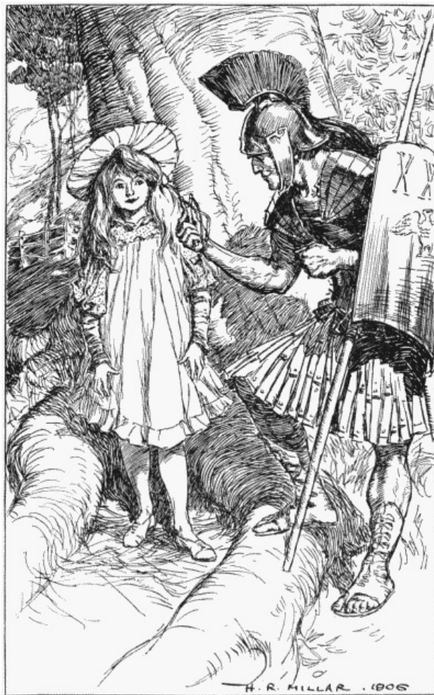
'You put the bullet into that loop.'

My people have lived at Vectis for generations. Vectis—that island West yonder that you can see from so far in clear weather. [147]