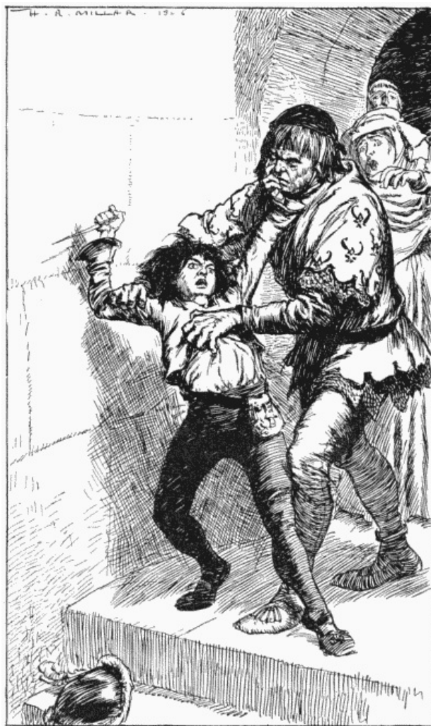
'He drew his dagger on Jehan, who threw him down the stairway.'

Sir Richard smiled. 'The King sent no second summons to Pevensey, nor did he ask why De Aquila had not obeyed the first. Yes, that was Fulke's work. I know not how he did it, but it was well and swiftly done.'