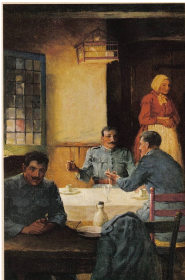
They also were pilgrims drawn by the love of Jeanne d'Arc to Domremy.

In the house where she was born, and passed her childhood, a crippled old woman was custodian. It was a humble dwelling of plastered stone, standing between two tall fir-trees, with ivy growing over the walls, lilies and hollyhocks blooming in the garden. Pierre found it not half so good a house as " L'Alouette ." But to the custodian it was more precious than a palace. In this upper room with its low mullioned window the Maid began her life. Here, in the larger room below, is the kneeling statue which the Princess Marie d'Orleans made of her. Here, to the right, under the sloping roof, with its worm-eaten beams, she slept and prayed and worked.