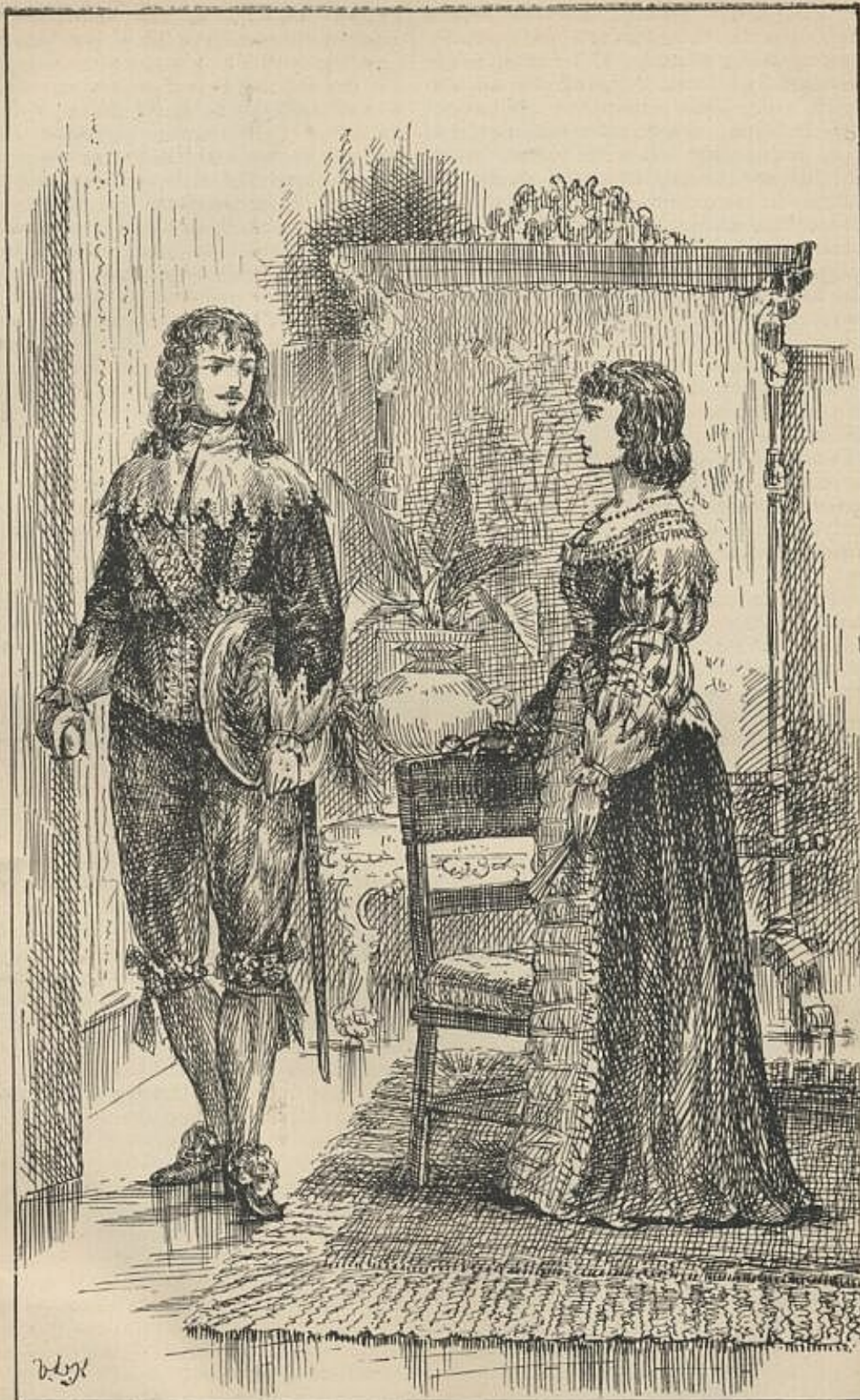
— BUT WHEN HE CAME TO THE DOOR HE PAUSED A MOMENT, TURNING UPON HER ONE LONG, DARK, INEXPLICABLE GAZE.— Evel. Eye , chap. xii, p. 697.

He withdrew very much after the etiquette of a subject leaving a crowned head—that is, nearly backwards; but when he came to the door he paused a moment, turning upon her one long, dark, inexplicable gaze, whilst the muscles of his hard, stony mouth were drawn back with a smile that contained in its expression a spirit that might be considered complacent, but which Alice interpreted as derisive and diabolical.