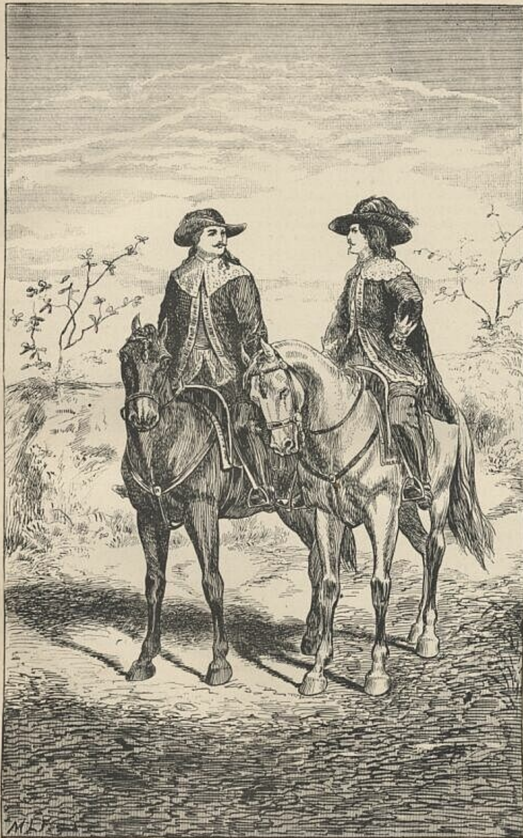
THE GAZE WAS LONG AND COMBATIVE IN ITS CHARACTER, AND CONSTITUTED A TRIAL OF THAT MORAL STRENGTH WHICH EACH, IN THE PECULIAR CONSTITUTION OF HIS BEING, SEEMED TO POSSESS.— Evil Eye; or the Black Spectre , Page 631.

He was mounted upon a powerful charger; for indeed it was evident at a glance that no other would have been equal to his weight. He was well-dressed—that is to say, in the garb of a country gentleman of the day. He wore his own hair, however, which fell in long masses over his shoulders, and a falling collar, which came down over his breast. His person was robust and healthy looking, and, what is not very usual in large men, it was remarkable for the most consummate proportion and symmetry. He wore boots and silver spurs, and his feet were unusually small, considering his size, as were also his hands. That, however, which struck the beholder with amazement, was the manly beauty of his features. At a first glance this was visible; but on contemplating them more closely you began to feel something strange and wonderful associated with a feeling of veneration and pleasure. Even this, however, was comparatively little to what a still more deliberate perusal of that face brought to light. There could be read that extraordinary union of humility and grandeur; but above all, and beyond all other expressions, there proceeded from his eyes, and radiated like a halo from every part of his countenance, a sense of power which was felt to be irresistible. His eyes, indeed, were almost transparent with light—a light so clear, benignant, and strong, that it was impossible to