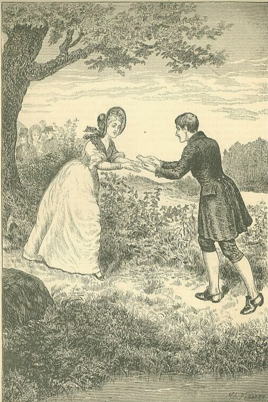
HAVING GAINED THE BANK, HE APPROACHED THEM, BUT WAS MET HALF WAY BY JANE, WHOSE EYES NOW SPARKLING THROUGH HER TEARS, SPOKE HER GRATITUDE IN LANGUAGE MUCH MORE ELOQUENT THAN ANY HER YONGER COULD UTTER.— Jane Sinclair , Part First, p. 5.

The youth first examined the bird, with a view to ascertain where it had been wounded, and immediately placed it with much gentleness in the eager hands of its mistress.