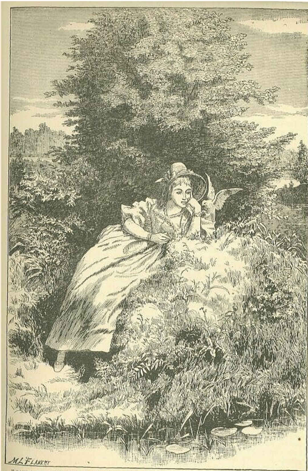
"HAVE I NOT OFTEN POINTED YOU OUT THE SPOT WHICH WOULD HAVE BEEN FATAL TO YOU, WERE IT NOT FOR HIM—FOR HIM?"— Jane Sinclair , Part Third, p. 44.

"I will beat you, Ariel," said she, "I will beat you—fie upon you. You an angel of light—no, no—have I not often pointed you out the spot which would have been fatal to you, were it not for him—for him! Stupid bird! there it is! do you not see it? No, as I live, your eye is turned up sideways towards me, instead of looking at it, as if you asked why, dear mistress, do you scold me so? And indeed I do not know, Ariel. I scarcely know—but oh, my dear creature, if you knew—if you knew—it is well you don't. I am here—so are you—but where is he?"