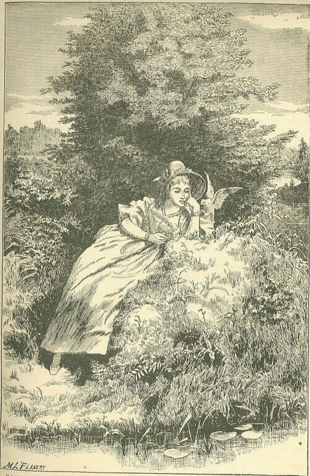
"HAVE I NOT OFTEN POINTED YOU OUT THE SPOT WHICH WOULD HAVE BEEN FATAL TO YOU, WERE IT NOT FOR HIM—FOR HIM?"— Jane Sinclair , Part Third, p. 44.