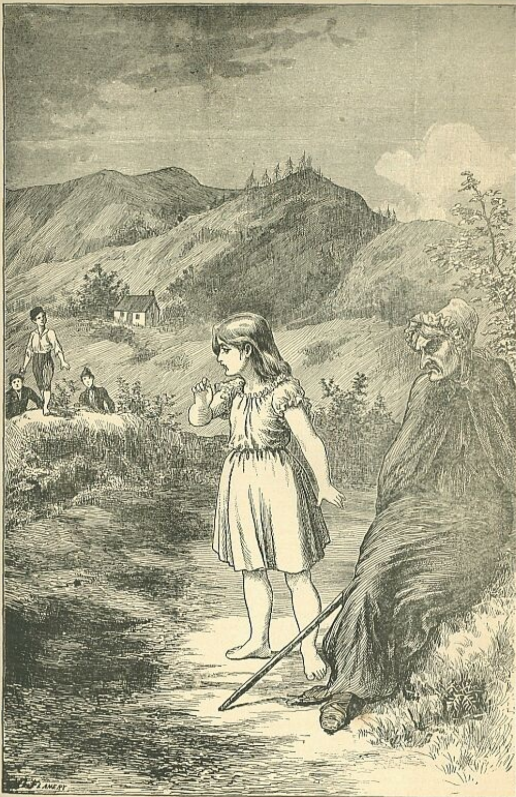
"SHAME! OH, SHAME!" WAS THE FIRST EXCLAMATION THAT ESCAPED HER, AND HER SWEET VOICE TREMBLED WITH ANGER.— The Proctor's Daughter , p. 124.

"Shame! oh, for shame!" were the first exclamations that escaped her, and her sweet voice trembled with anger.