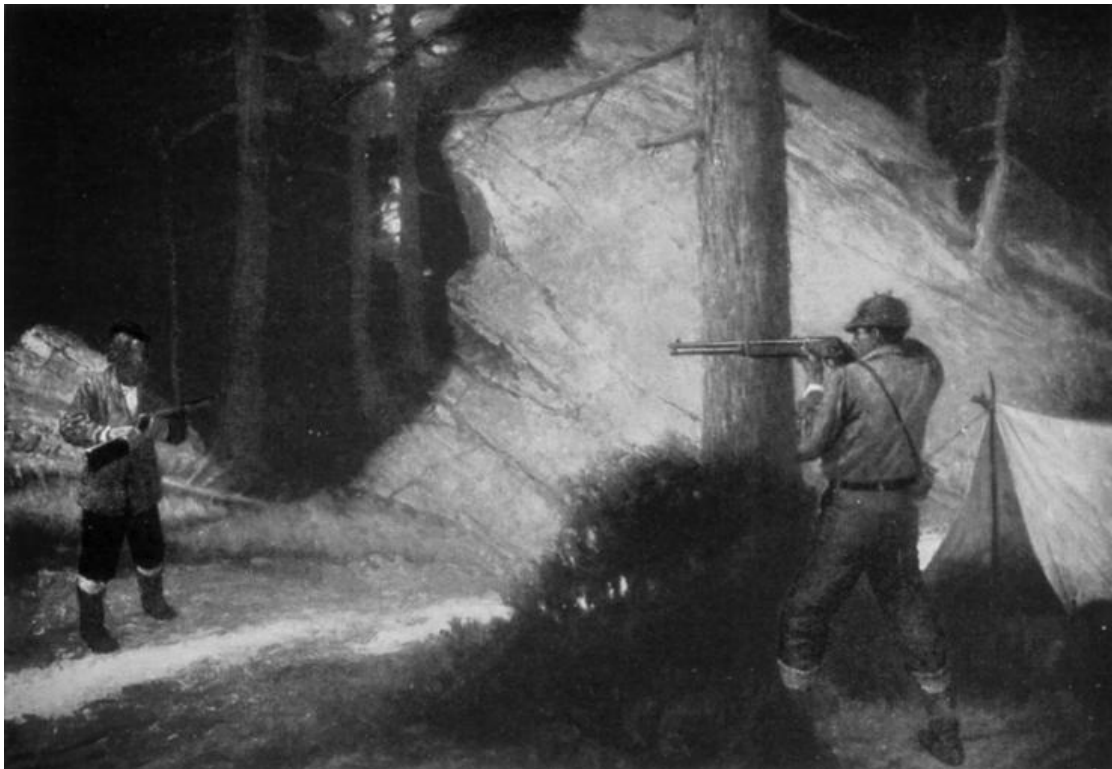
"YOU STAND WHERE YOU IS AND DROP YOUR GUN"

"I say again, give me that silver fox you stole from father!"