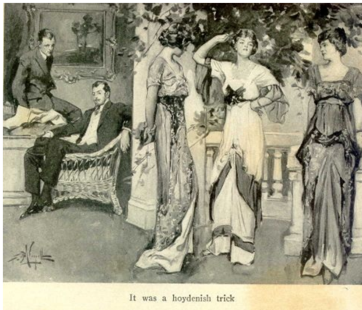
It was a hoydenish trick