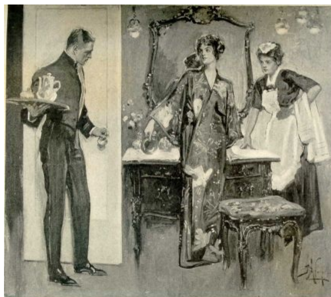
"Come in," said a voice

"Come in," said a voice in answer to his knock.