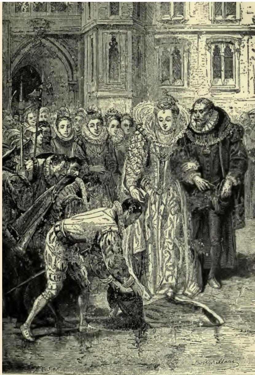
“The gallant, throwing his cloak from his shoulders, laid it on the miry spot.”