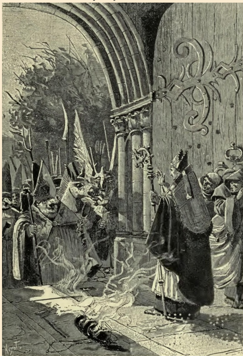
"The appearance of the crowd was grotesque in the extreme."

The aboriginal Britons, who first entered, were ushered in by two ancient Druids, whose hoary hair was crowned with a chaplet of oak, and who bore in their hands branches of mistletoe. The maskers who followed these venerable figures were succeeded by two Bards, arrayed in white, and bearing harps, which they occasionally touched, singing at the same time certain stanzas of an ancient hymn to Belus, or the Sun. The aboriginal Britons had been selected from amongst the tallest and most robust young gentlemen in attendance on the court. Their masks were accommodated with long, shaggy beards and hair; their vestments were of the hides of wolves and bears; while their legs, arms, and the upper parts of their bodies, being sheathed in flesh-coloured silk, on which were traced in grotesque lines representations of the heavenly bodies, and of animals and other terrestrial objects, gave them the lively appearance of our painted ancestors, whose freedom was first trencched upon by the Romans.