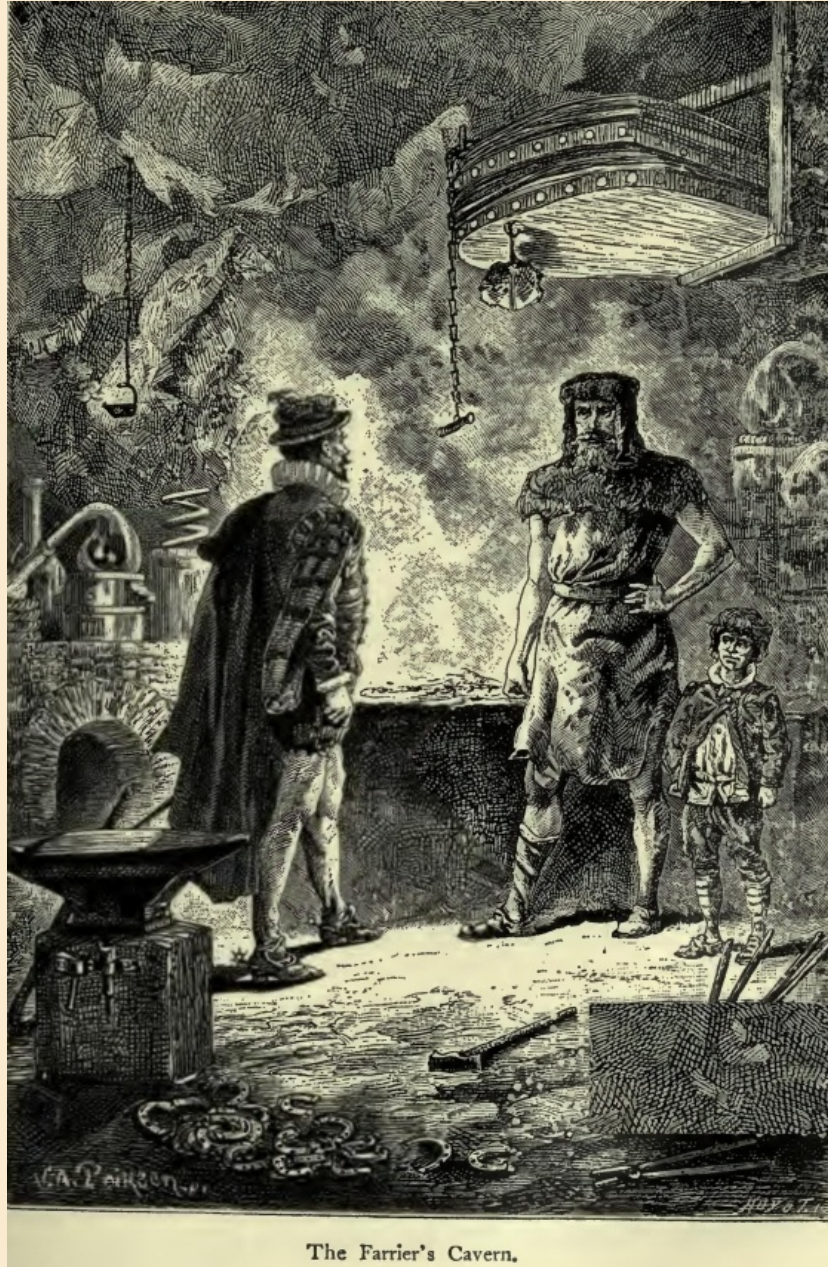
The Farrier's Cavern.

never forged of earthly iron, for the stone it was made of was shot from the moon." And in effect Tressilian did immediately hear the light stroke of a hammer, as when a farrier is at work. The singularity of such a sound, in so very lonely a place, made him involuntarily start; but looking at the boy, and discovering, by the arch malicious expression of his countenance, that the urchin saw and enjoyed his slight tremor, he became convinced that the whole was a concerted stratagem, and determined to know by whom, or for what purpose, the trick was played off.