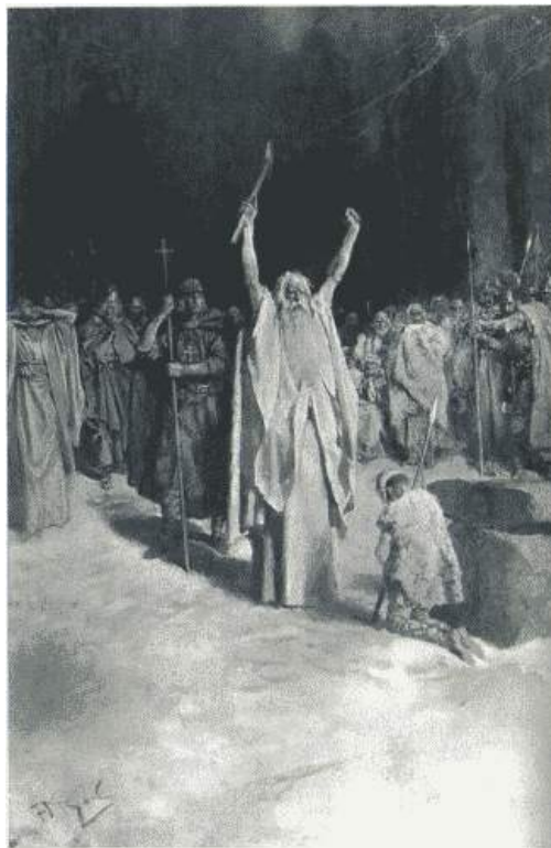
The sacred hammer of the god Thor

Then the road plunged again into a dense thicket, traversed it, and climbing to the left, emerged suddenly upon a glade, round and level except at the northern side, where a swelling hillock was crowned with a huge oak-tree. It towered above the heath, a giant with contorted arms, beckoning to the host of lesser trees. "Here," cried Winfried, as his eyes flashed and his hand lifted his heavy staff, "here is the Thunder-oak; and here the cross of Christ shall break the hammer of the false god Thor."