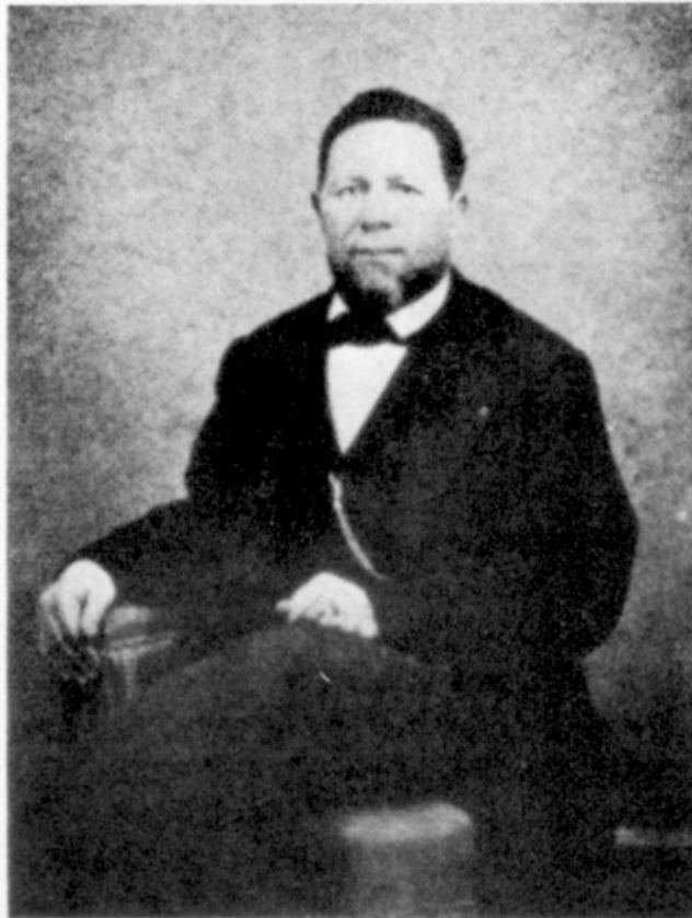
HON. HIRAM R. REVELS.