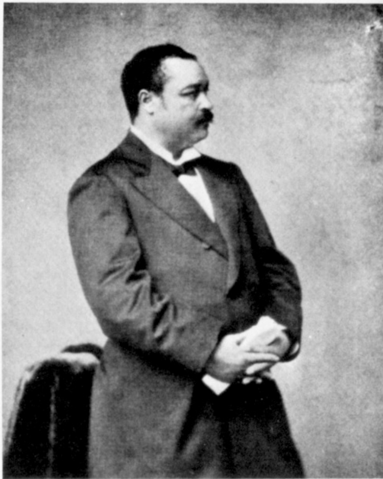
HON. B. K. BRUCE United States Senator, 1875-1881