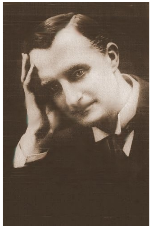
SIR EDWARD GREY, British Secretary of State for Foreign Affairs.

It must be obvious to any person who reflects upon the situation that the moment the dispute ceases to be one between Austria-Hungary and Servia and becomes one in which another great power is involved, it can but end in the greatest catastrophe that has ever befallen the Continent of Europe at one blow; no one can say what would be the limit of the issues that might be raised by such a conflict; the consequences of it, direct and indirect, would be incalculable.