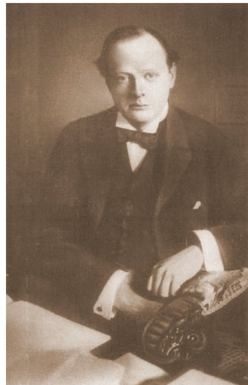
W. L. SPENCER CHURCHILL, British First Lord of the Admiralty.

We did not enter upon this war with the hope of easy victory; we did not enter upon it in any desire to extend our territory, or to advance and increase our position in the world; or in any romantic desire to shed our blood and spend our money in Continental quarrels. We entered