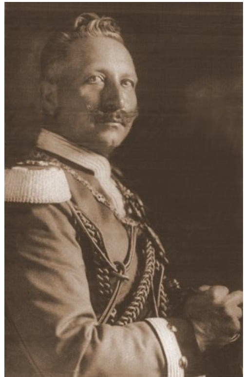
WILHELM II., German Emperor.

Archduke Francis Ferdinand, opened up a great abyss. My high ally, the Emperor and King Francis Joseph, was compelled to take up arms to defend the security of his empire against dangerous intrigues from a neighboring State. In the pursuit of her proper interests the Dual Monarchy has found her path obstructed by the Russian Empire. Not only our duty as an ally calls us to the side of Austria-Hungary, but on us falls also the mighty task of defending the ancient community of culture of the two kingdoms and our own position in the world against the attack of hostile powers. With a heavy heart I have been compelled to mobilize my army against a neighbor with whom it has fought side by side on so many fields of battle. With sincere sorrow I saw a friendship broken of which Germany had given faithful proofs. The Imperial Russian Government, yielding to the pressure of an insatiable nationalism, has taken sides with a State which by encouraging criminal attacks has brought on the evil of this war. That France, also, placed herself on the side of our enemies could not surprise us. Too often have our efforts to arrive at friendlier relations with the French Republic come in collision with old hopes and ancient malice.