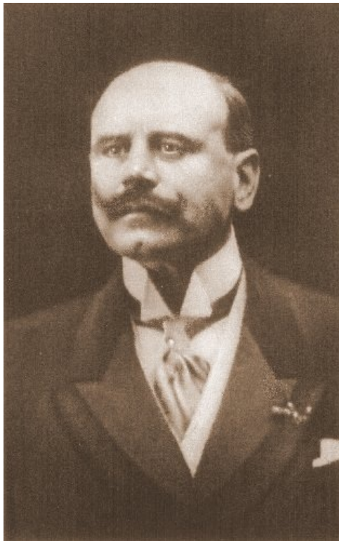
CARTON DE WIART, Minister of Justice, Spokesman of the Royal Belgian Commission to the United States.

have betrayed our obligations toward the others. And it was the sense of our international obligations as well as that of our dignity and honor that has driven us to resistance.