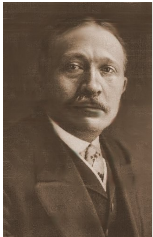
RENE VIVIANI, French Premier.

to the Sûreté Générale that the Germans have just opened fire on the frontier station of Delle-Petitcroix. Two German cavalry officers have just been killed at Roncray and Boxson, ten kilometers on our side of the frontier.