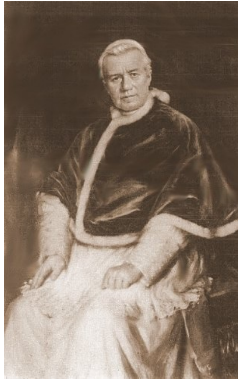
HIS HOLINESS THE LATE POPE PIUS X. (From a Painting by A. Muller-Ury.)