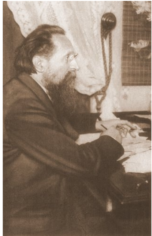
JULES GUESDE French Cabinet Minister and Exponent of French Socialism, ( Photo from Trans Atlantic Co. )

Jules Guesde and Marcel Sembat did no more than their duty!