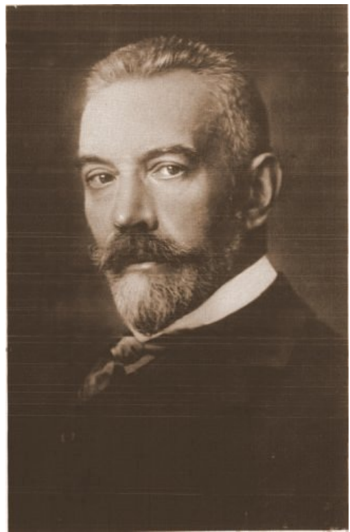
T. VON BETHMANN-HOLLWEG, German Imperial Chancellor.

At the same time we had to make sure of the position France would take. To our direct question whether in case of a German-Russian war she would remain neutral, France answered that she would do what she had to do in her own interests. [Laughter.] That was an evasive if not a negative answer to our question.