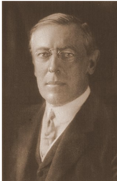
WOODROW WILSON, President of the United States of America.

Germany was appreciative of the American Government's interest and offer of services in trying to make peace. Germany did not want war, but had it forced on her. Even if she defeats France, she must likewise vanquish both Great Britain and Russia, as all three have made an agreement not to make peace except by common consent. Similarly, England has announced through Premier Asquith and her diplomatists and the newspapers that she intends to fight to the limit of her endurance. In view of that determination on the part of Great Britain, the United States ought to get proposals of peace from the Allies. Germany could accept only a lasting peace, one that would make her people secure against future attacks. To accept mediation now would be interpreted by the Allies as a sign of weakness on the part of Germany and would be misunderstood by the German people, who, having made great sacrifices, had the right to demand guarantees of security.