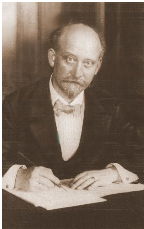
PHILIPP SCHEIDEMANN, Chairman German Socialist Party and ex-Vice President of the Reichstag.

terrifying magnitude. And it is with this fact that we have now to reckon. Russia, France, Belgium, England, Servia, Montenegro and Japan are now involved in this battle for "freedom and culture," which means fighting against Germany, against the world which has given birth to Goethe, to Kant and to Karl Marx! It would be laughable were the situation not so desperately grave.