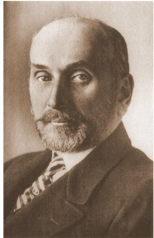
STATE COUNCILLOR SAZONOF Russian Minister of Foreign Affairs.

Had there been any doubts concerning these matters on the part of the British Government, the continual urging of Russian and French diplomatists must have made things plain. Russia's aggressive policy, and not the Austrian declaration of war on Servia, which did not come until five days later, led to the European war. Servia meant so little to England, although England traditionally poses as a protector of small nations, that the British Ambassador in St. Petersburg was able to describe England's interest in the kingdom on the Save as "nil." Only later, after the