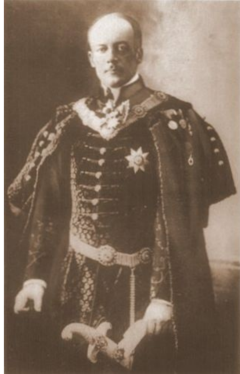
COUNT LEOPOLD BERCHTOLD. Austro-Hungarian Minister for Foreign Affairs.

Austria-Hungary looks upon this war as a purely defensive one, which has been forced on her by the agitation directed by Russia against her very existence. Austria-Hungary has given many proofs in late years of her peaceful intention. She refrained from any interference with arms in the Balkan war, though her interests were at stake. Subsequent events have proved what a serious danger the increase in territory and prestige which it brought Serbia were for Austria-Hungary. Serbia's ambitions have since grown and have been solely directed against the Dual Monarchy. Russia has tacitly approved of Serbia's action because Russian statesmen wish to form an iron ring of enemies around Austria-Hungary and Germany in order that Russia's grasp on Constantinople and on Asia should never again be meddled with. Austro-Hungarian soldiers are fighting for their homes and for the maintenance of their country, the Russians are fighting to help the Russian Czar to gain the rule of the world, to destroy all his neighbors who may be dangerous to Russian ambitions. England is helping the Russians to oust her German rival. She feared for some time that German culture and German scientific methods would prove the stronger in a peaceful competition, and she now hopes to crush Germany with the help of Russia and France. And France is fighting to win back Alsace-Lorraine, to take her revenge on Germany, which the French nation has been aiming at for the last forty-four years.