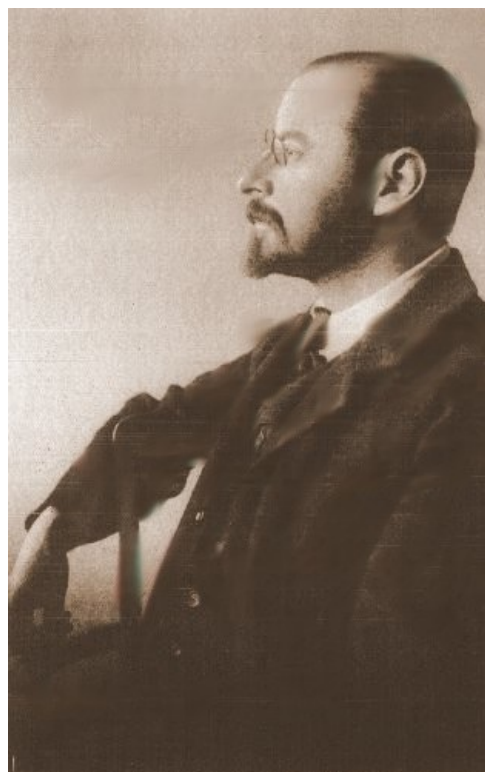
EMIL VAN DER VELDE, Belgian Minister of State and Chairman International Socialist Bureau.

Who was right, who wrong? Did the majority of the German Socialists, under the leadership of David, do right in voting the war credits asked by the Kaiser? Or did the minority do right, under the direction of Dr. Liebknecht, in refusing these credits? Who can pass judgment? But this we do know and can truthfully say—not a single capitalistic Government of all Europe but shares in the guilt.