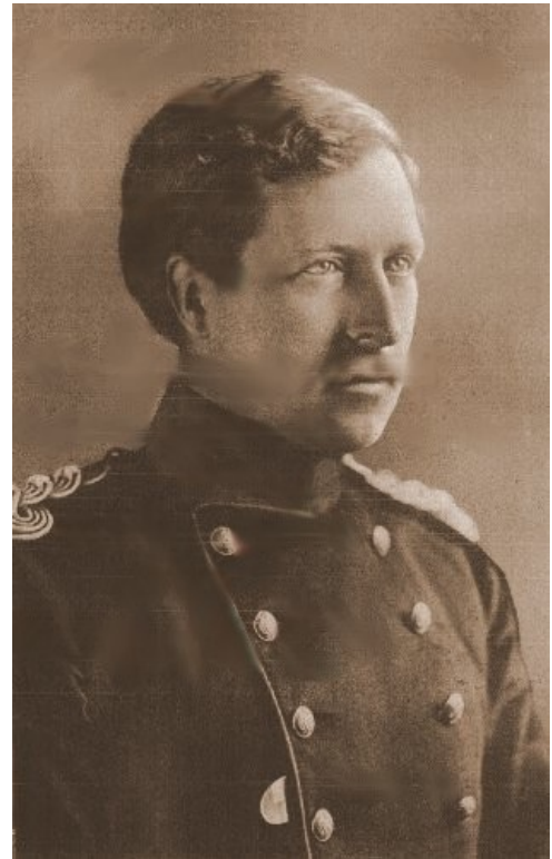
ALBERT, KING OF THE BELGIANS