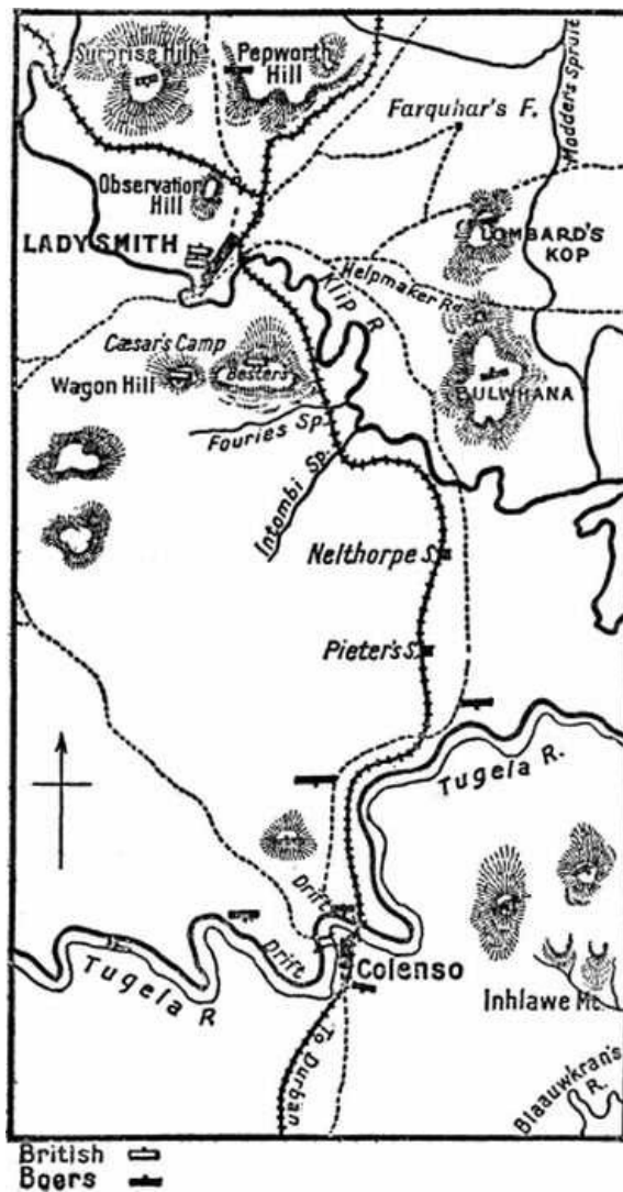
THE COUNTRY ROUND LADYSMITH.