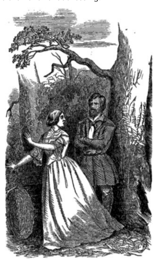
"Looking up, she saw a tall, dark man standing before her, his eye bent upon hers with a look that sent the blood to her heart."—See page 36.

"Miss Walton, I believe I have the honor of addressing."