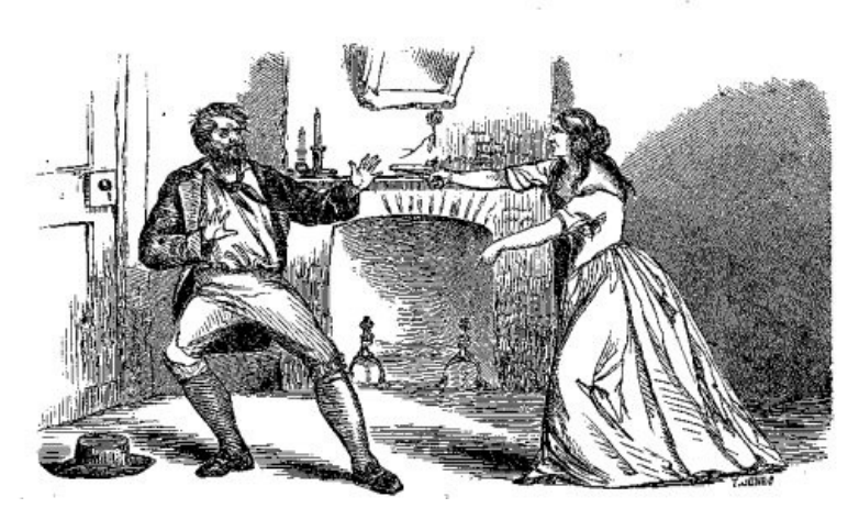
"And drawing a pistol, which some freak had caused her to conceal in her dress, she made it ready, and, with her finger on the trigger, aimed it at his heart."— See page 29.

"It will do you no good. My sister gave the young lady an attested certificate, stating that she passed the whole time with her, the two together, that the door to their room was locked, and that they were undisturbed during the night.—Nothing like a 'woman's wit!'"