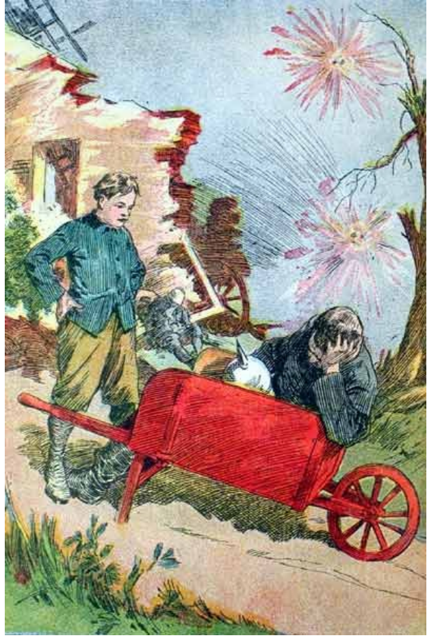
"I OUGHT TO DUMP YOU OUT."

*** START OF THE PROJECT GUTENBERG EBOOK THE CHILDREN OF FRANCE ***