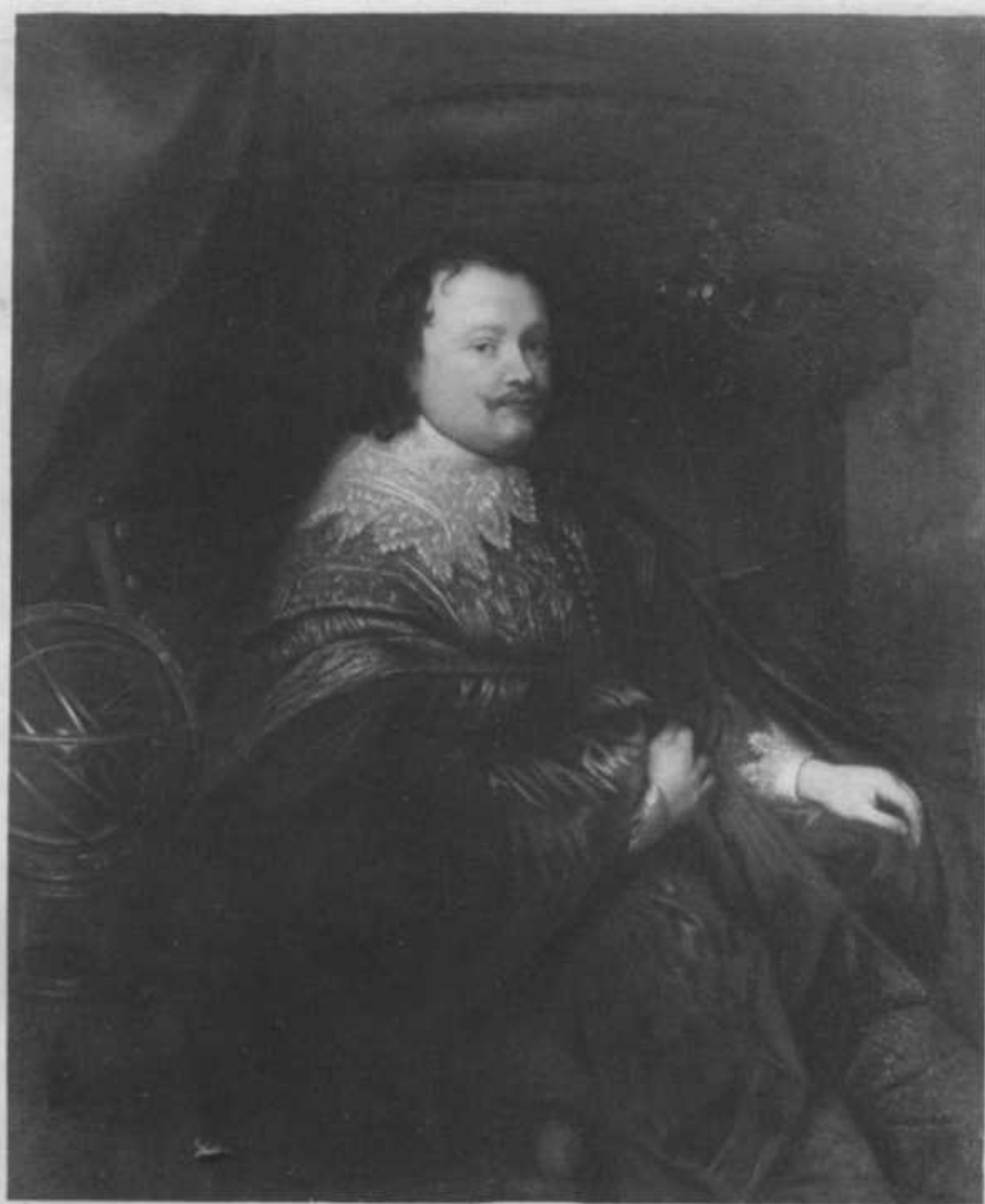
Sir Kenelm Digby Knight. After the Painting by Sir Anthony Vandryke in His Majesty's Collection at Windsor Castle.