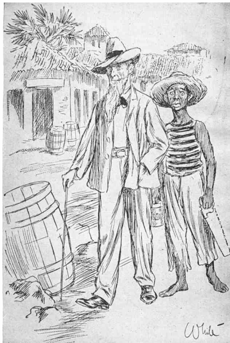
"The old medical outrage ... had a nigger along."