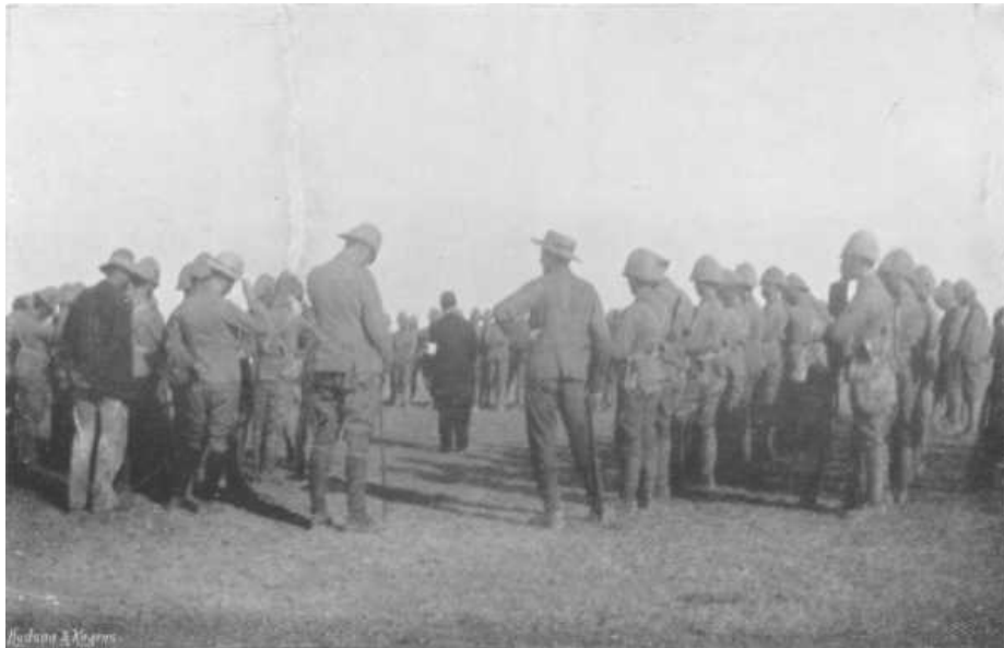
PARADE SERVICE ON THE TUGELA.

The months that witnessed the welding of the British Empire into one great family witnessed also one great effort for her soldiers, and one glorious chain of prayer for their conversion. What wonder that hundreds, if not thousands, turned to God!