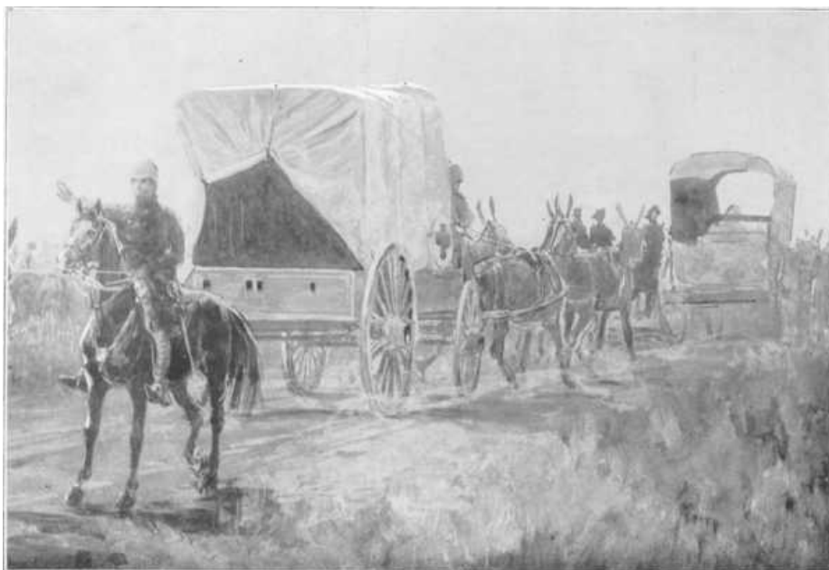
AMBULANCE WAGONS ON THEIR WAY TO THE FIELD.

'Of course, as soon as it was light the doctors of the Bearer Company, with dhoolies, were out to seek amongst the rocks for the wounded and the slain, and it was not long before I was on my way to join them. But on reaching our outpost on Observation Hill I was told that the Boers were so infuriated at the loss of another gun that they had taken the doctors prisoners and were going to send them to Pretoria. But just at that moment a native came in with a note from the senior medical officer, asking that surgical necessaries be sent at once, for many of the wounded were seriously hurt. After much parley through the telephone with headquarters, it was at last decided that the things be sent at once, and if I were willing that I should be the bearer, for the Boers were more likely to respect "the cloth" than anything else; also by previous visits I had become known to many of the burghers. So forthwith I started upon what many said was my way to Pretoria, and on reaching the enemy, truth to say, it looked very much like it. They were furiously angry, and I was made to join the little group of doctors, bearers and wounded, who, under a strong guard, were sitting and lying under the shade of a tree.