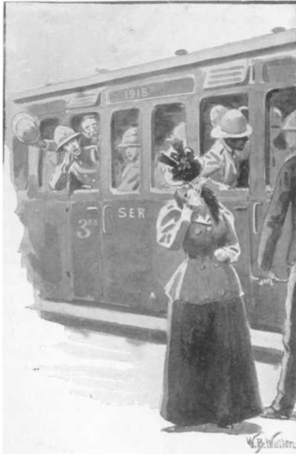
OFF TO SOUTH AFRICA.