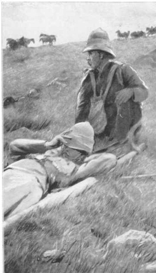
AMBULANCE WORK ON THE FIELD.

And so through blood and fire, over heaps of slain, General Sir Redvers Duller passed into Ladysmith—passed in just in time; passed in to see men with wan cheeks and sunken eyes—an army of skeletons; but passed in to find the old flag still flying.