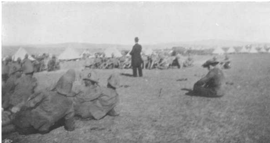
MORNING SERVICE ON THE VELDT.

The pens, ink, and paper, provided free, were a great boon to the soldiers. From three to four hundred sheets of paper per day were given to the men, who, of course, had to make special application for it.