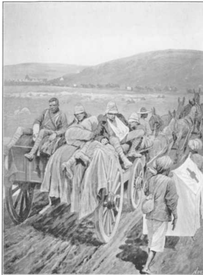
BRINGING BACK THE WOUNDED.

The day for parade services had gone by, and all days were now the same; but there was other work the chaplains could do, and this they attempted to the best of their ability.