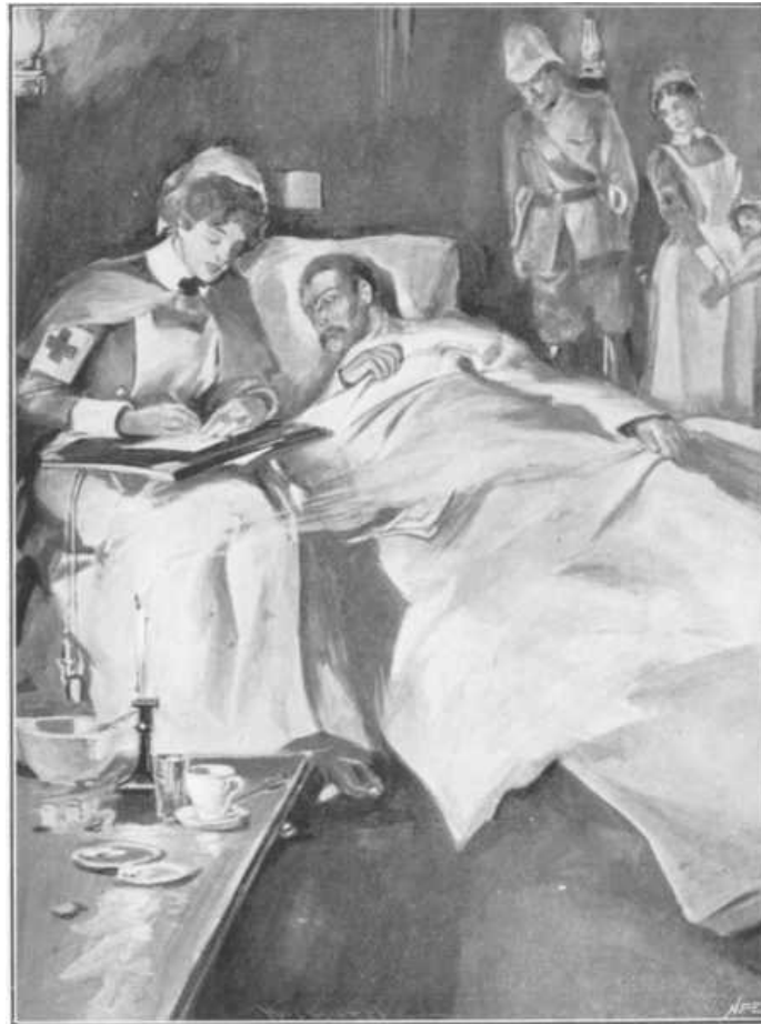
HIS LAST LETTER.

*** START OF THE PROJECT GUTENBERG EBOOK FROM ALDERSHOT TO PRETORIA ***