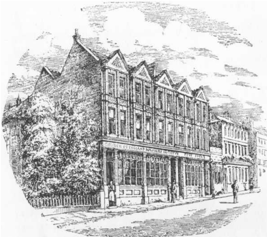
CHURCH OF ENGLAND SOLDIERS' HOME, ALDERSHOT.