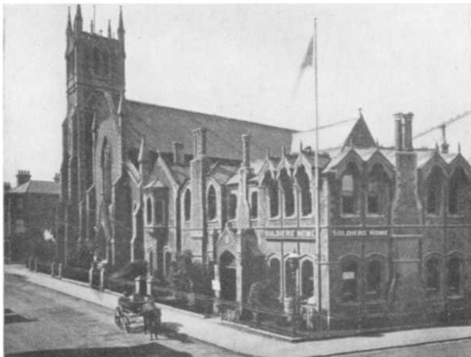
GROSVENOR ROAD SOLDIERS' HOME, ALDERSHOT.