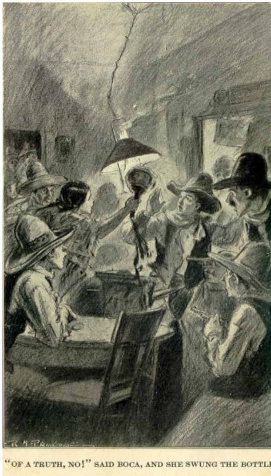
"OF A TRUTH, NO!" SAID BOCA, AND SHE SWUNG THE BOTTLE