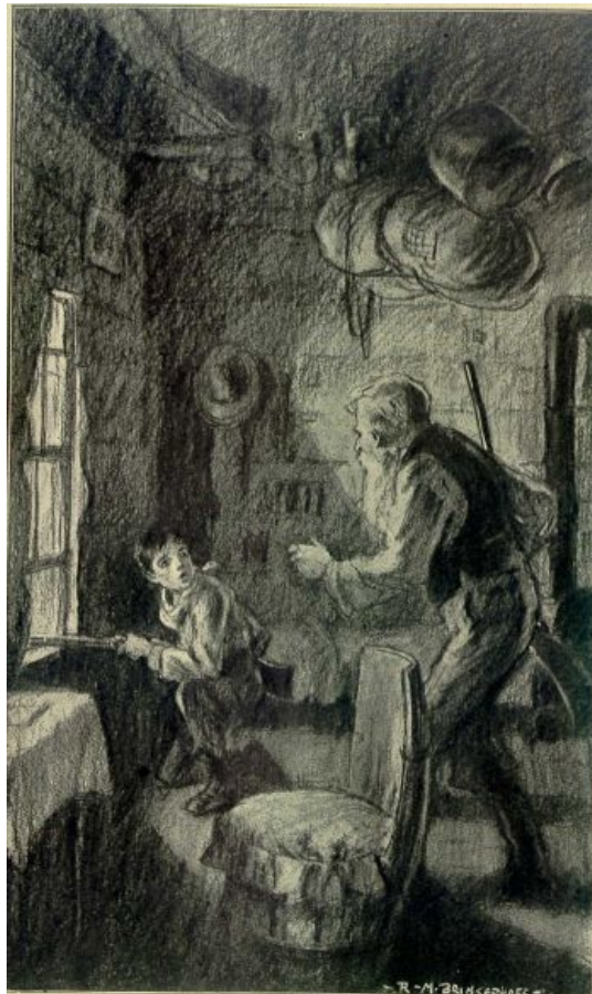
"SAY, AIN'T WE PARDNERS?"

Young Pete had crept to the window and was gazing out at the sinking flames. "Say, ain't we pardners?" he queried irritably. "You said we was when you brung me up here. And pardners stick, don't they? I reckon if it was my shack that was gittin' rushed, you 'd stick, and not go bellyin' under the bunk and hidin' like a dog-gone prairie-dog."