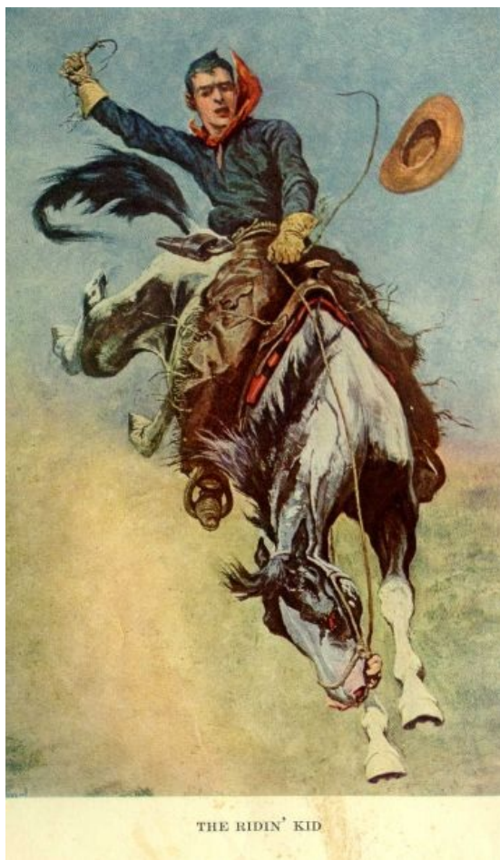
[Frontispiece: The Ridin' Kid]

*** START OF THE PROJECT GUTENBERG EBOOK THE RIDIN' KID FROM POWDER RIVER ***