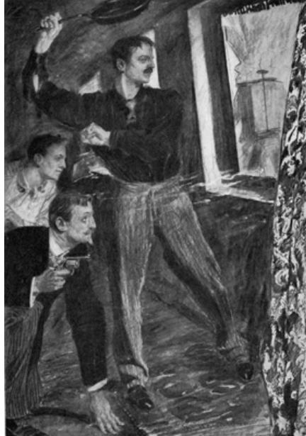
Brissac hurled the skillet like a clumsy discus

"We don't," said Ford shortly. "We're merely thankful that all humankind habitually shoots high when it's excited or in a hurry."