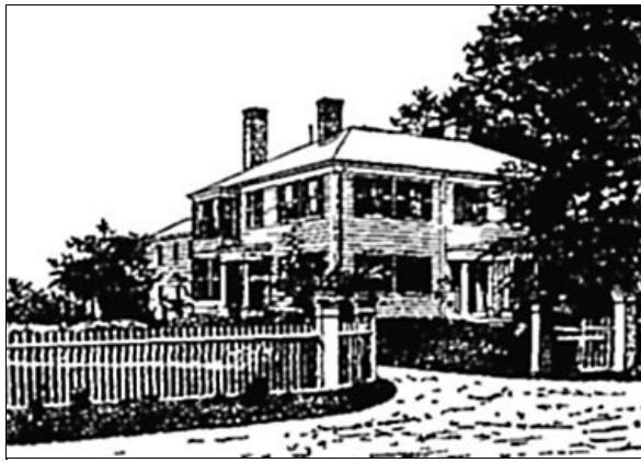
HOME OF EMERSON IN CONCORD.