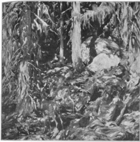
Plate 21.—Sargent. "The Hermit." In the Metropolitan Museum of Art.

count, and the most radiant blond skin of the fairest woman has become an insignificant pinkish spot no more important than a stone and not half so important as a flower. Humanity is absorbed into the landscape.