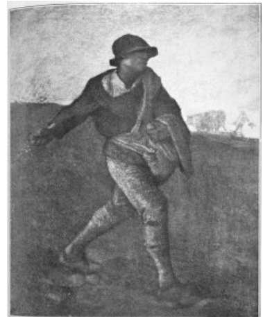
Plate 2.—Millet. "The Sower." In the Metropolitan Museum of Art. Vanderbilt collection.

At Barbizon he neither resumed the costume nor led the life of a peasant. He wore sabots, as hundreds of other artists have done, before and since, when living in the country in France. Sabots are very cheap and very dry and not uncomfortable when you have acquired the knack of wearing them. In other respects he dressed and lived like a small bourgeois, and was monsieur to the people about him. Barbizon was already a summer resort for artists before he came there, and the inn was full of painters; while others, of whom