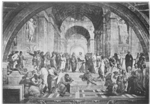
Plate 14.—Raphael. "The School of Athens." In the Vatican.

The window in the opposite wall is to one side of the middle, and here Raphael meets the new problem with a new solution. He places a