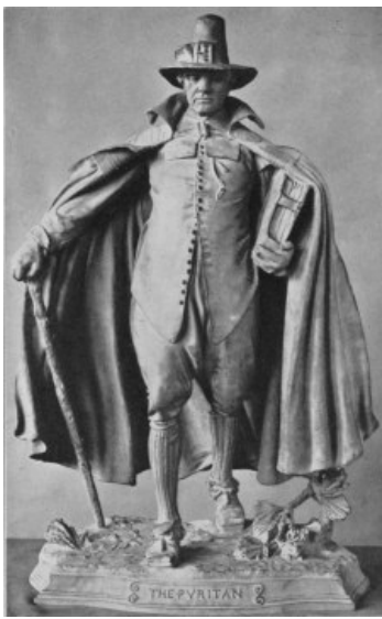
Plate 29.—Saint-Gaudens. "Deacon Chapin."

thing it is is the imaginative power displayed in it—the depth of emotion expressed, and expressed with perfect simplicity and directness and an entire absence of parade. The negro troops are marching steadily, soberly, with high seriousness of purpose, and their white leader rides beside them, drawn sword in hand, but with no military swagger, courageous, yet with a hint of melancholy, ready not only to lay down his life but to face, if need be, an ignominious death for the cause he believes to be just. And above them, laden with poppy and with laurels, floats the Death Angel pointing out the way.