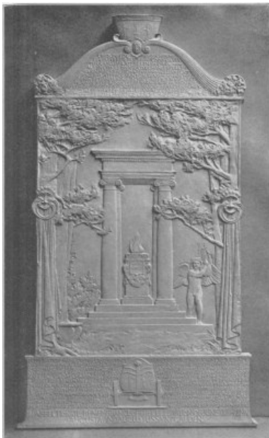
Plate 23.—Saint-Gaudens. "Plaquette Commemorating Cornish Masque."

Some part of the vivid and lovable personality of Augustus Saint-Gaudens must have been visible, almost at a glance, to any one who ever came in contact with him—to any one, even, who ever saw his portrait. In his spare but strong-knit figure, his firm but supple hands, his manner of carrying himself, his every gesture, one felt the abounding vitality, the almost furious energy of the man. That extraordinary head, with its heavy brow beetling above the small but piercing eyes, its red beard and crisp, wiry hair, its projecting jaw and great, strongly modelled nose, was alive with power—with power of intellect no less than of will. His lack of early education gave him a certain diffidence and a distrust of his own gifts of expression. He was apt to overrate the mere verbal facility of others and to underestimate himself in the comparison—indeed, a certain humility was strongly marked in him, even as regards his art, though he was self-confident also. When he was unconstrained his great powers of observation, his shrewdness of judgment, his bubbling humor, and a picturesque vivacity of phrase not uncommon among artists made him one of the most entrancing of talkers.