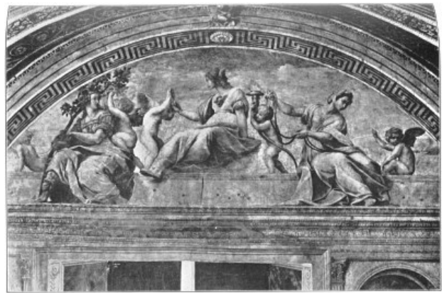
Plate 16.—Raphael. "Jurisprudence." In the Vatican.

Draw an imaginary straight line from the boss