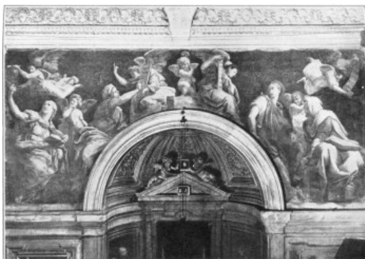
Plate 19.—Raphael. "The Sibyls." Santa Maria della Pace, Rome.