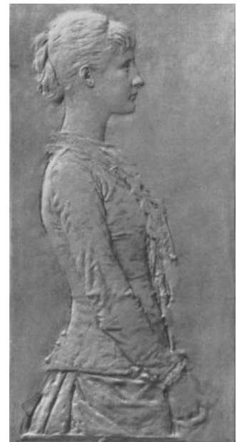
Copyright, De W.C. Ward. Plate 26.— Saint-Gaudens. "Sarah Redwood Lee."

the Florentine Renaissance, the means of escape from the matter of fact. The concrete art of sculpture becomes an art of mystery and of suggestion—an art having affinities with that of painting. Hollows are filled up, shadows are obliterated, lines are softened or accentuated, as the effect may require, details are eliminated or made prominent as they are less or more essential and significant, as they hinder or aid the expressiveness of the whole. It is by such methods that beauty is achieved, that the most unpromising material is subdued to the purposes of art, that even our hideous modern costume may be made to yield a decorative effect. Pure sculpture, as the ancients understood it, the art of form per se , demands the nude figure, or a costume which reveals it rather than hides it. The costume of to-day reveals as little of the figure as possible, and, unlike mediæval armor, it has no beauty of its own. A painter may make it interesting by dwelling on color or tone or texture, or may so lose it in shadow that it ceases to count at all except as a space of darkness. A sculptor can do none of these things, and if he is to make it serve the ends of beauty he has need of all the resourcefulness and all the skill