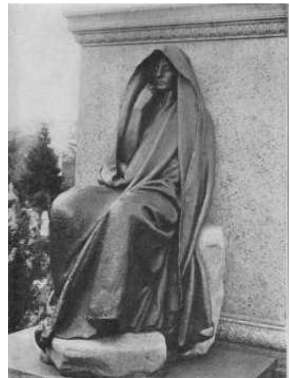
Plate 30.—Saint-Gaudens. "Adams Memorial."

The Sherman group (Pl. 32), though it has been more criticised than the "Shaw Memorial," seems to me, if possible, an even finer work. The main objection to it has been that it is not sufficiently "monumental," and, indeed, it has not the massiveness nor the repose of such a work as Donatello's "Gattamelata," the greatest of all equestrian statues. It could not well have these qualities in the same degree, its motive being what it is, but they are, perhaps, not ill exchanged for the character and the nationalism so marked in horse and rider and for the irresistible onward rush of movement never more adequately expressed. In all other respects the group seems to me almost beyond criticism. The composition—composition, now, in the round and to be considered from many points of view—builds up superbly; the flow of line in wing and limb and drapery is perfect; the purely sculptural problems of anatomical rendering, equine and human, are thoroughly resolved; the modelling, as such, is almost as fine as the design.