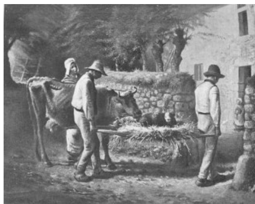
Plate 7.—Millet. "The New-Born Calf." In the Art Institute, Chicago.

The background of "The Gleaners," with its baking stubble-field under the midday sun, its grain stacks and laborers and distant farmstead, all tremulous in the reflected waves of heat, indistinct and almost indecipherable yet unmistakable, is nearly as wonderful; and no one has ever so rendered the solemnity and the mystery of night as has he in the marvellous "Sheepfold" of the Walters collection. But the greatest of all his landscapes—one of the greatest landscapes ever painted—is his "Spring" (Pl. 10), of the Louvre, a pure landscape this time, containing no figure.