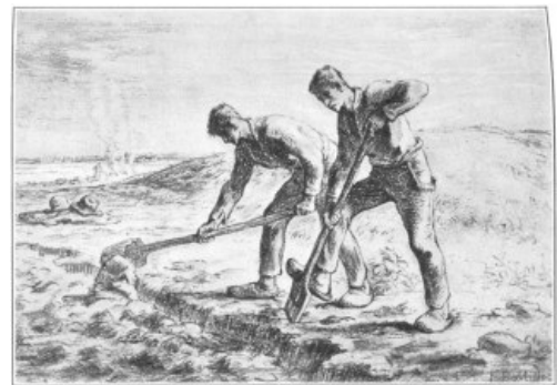
Plate 4.—Millet. "The Spaders."

Take, for an instance, the earliest of his masterpieces, the first great picture by which he marked his emancipation and his determination henceforth to produce art as he understood it without regard to the preferences of others. Many of his preliminary drawings and studies exist and we can trace, more or less clearly, the process by which the final result was arrived at. At first we have merely a peasant sowing grain; an everyday incident, truly enough observed but nothing more. Gradually the background is cut down, the space restricted, the figure enlarged until it fills its frame as a metope of the Parthenon is filled. The gesture is ever enlarged and given more