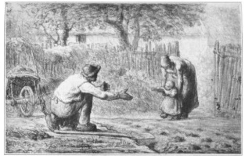
Plate 8.—Millet. "The First Steps."

In the face of such results as these it seems absurd to discuss the question whether or not Millet was technically a master of his trade, as if the methods that produced them could possibly be anything but good methods for the purpose; but it is still too much the fashion to say and think that the great artist was a poor painter—to speak slightly of his accomplishment in oil-painting and to seem to prefer his drawings and pastels to his pictures. We have seen that he was a supremely able technician in his pot-boiling days and that the color and handling of his early pictures were greatly admired by so brilliant a virtuoso as Diaz. But this "flowery manner" would not lend itself to the expression of his new aims and he had to invent