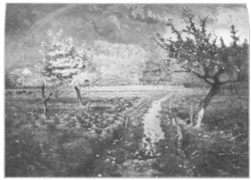
Plate 10.—Millet. "Spring." In the Louvre.