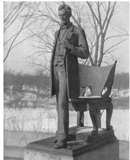
Plate 28.—Saint-Gaudens. "Lincoln."

These are merits, and merits of a very high order, enough of themselves to place the work in the front rank of modern sculpture, but they are, after all, its minor merits. What makes it the great