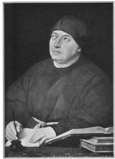
Plate 20.—Raphael. "Portrait of Tommaso Inghirami." In the collection of Mrs. Gardner.

arts has its qualities proper to it alone, and it may be right to estimate the painter, the sculptor, the architect, or the musician according to his eminence in those qualities which are distinctive of his particular art and which separate it most sharply from the other arts. In that sense we are right to call Frans Hals a greater painter than Raphael. But if we estimate a man's artistry by the same standard, whatever the form of art in which it expresses itself, rating him by his power of coordinating and composing notes or forms or colors into a harmonious and beautiful unity, then must we place Raphael pretty near where he used to be placed, admitting but a choice few of the very greatest to any equality with him. If we no longer call him "the prince of painters" we must call him one of the greatest artists among those who have practised the art of painting.