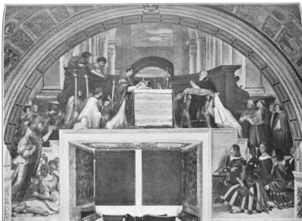
Plate 17.—Raphael. "The Mass of Bolsena." In the Vatican.

separate picture in each of the unequal rectangles, carries a simulated cornice across at the level of the window head, and paints, in the segmental lunette thus left, the so-called "Jurisprudence" (Pl. 16), which seems to many decorators the most perfect piece of decorative design that even Raphael ever created—the most perfect piece of design, therefore, in the world. Its subtlety of spacing, its exquisiteness of line, its monumental simplicity, rippled through with a melody of falling curves from end to end, are beyond description—the reader must study them for himself in the illustration. One thing he might miss were not his attention called to it—the ingenious way in which the whole composition is adjusted to a diagonal axis that the asymmetry of the wall may be minimized.