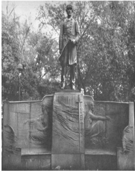
Plate 27.—Saint-Gaudens. "Farragut."

perfection of workmanship, these are among the world's few worthy monuments to its great men.