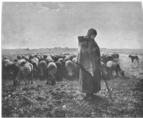
Plate 9.—Millet. "The Shepherdess." In the Chauchard collection, Louvre.

But if we cannot admit that Millet's drawings are better than his paintings, we may be very glad he did them. His great epic of the soil must have lacked many episodes, perhaps whole books and cantos, if it had been written only in the slower and more elaborate method. The comparative slightness and rapidity of execution of his drawings and pastels enabled him to register many inventions and observations that we must otherwise have missed, and many of these are of the highest value. His long training in seizing the essential in anything he saw enabled him, often, to put more meaning into a single rapid line than another could put into a day's painful labor, and some of his slightest sketches are astonishingly and commandingly expressive. Other of his drawings were worked out and pondered over almost as lovingly as his completest pictures. But so instinctively and inevitably was he a composer that everything he touched is a complete whole—his merest sketch or his most elaborated design