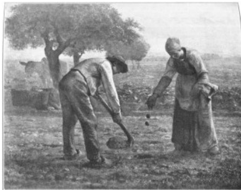
Plate 5.—Millet. "The Potato Planters." In the Quincy A. Shaw Collection.

sweep and majesty, the silhouette is simplified and divested of all accidental or insignificant detail. A thousand previous observations are compared and resumed in one general and comprehensive formula, and the typical has been evolved from the actual. What generations of Greek sculptors did in their slow perfectioning of certain fixed types he has done almost at once. We have no longer a man sowing, but "The Sower" (Pl. 2), justifying the title he instinctively gave it by its air of permanence, of inevitability, of universality. All the significance which there is or ever has been for mankind in that primæval action of sowing the seed is crystallized into its necessary expression. The thing is done once for all, and need never—can never be done again. Has any one else had this power since Michelangelo created his "Adam"?