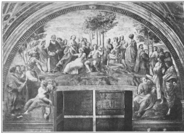
Plate 15.—Raphael. "Parnassus." In the Vatican.

in the soffit of the arch through the middle of the Janus-head of Prudence. It will accurately bisect the central group, composed of this figure and her two attendant genii, will pass through her elevated left knee, the centre of a system of curves, and the other end of it will strike the top of the post or mullion that divides the window opening into two parts.