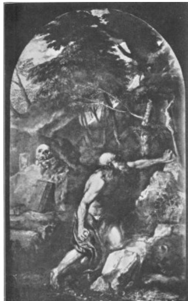
Plate 22.—Titian. "St. Jerome in the Desert." In the Brera Gallery, Milan.