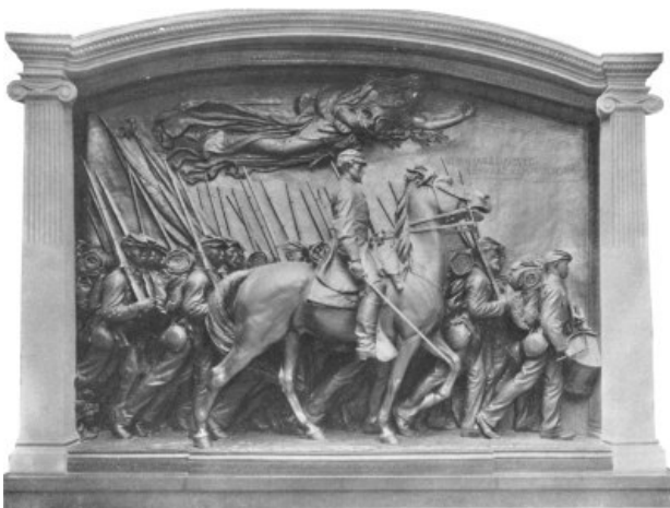
Plate 31.—Saint-Gaudens. "Shaw Memorial."

To the boyish Saint-Gaudens Sherman had seemed the typical American hero. To the matured artist he had sat for an admirable bust. The sculptor had thus an unusual knowledge of his subject, a perfect sympathy with his theme; and he has produced a work of epic sweep and significance. Tall and erect, the general sits his horse, his military cloak bellying out behind him, his trousers strapped down over his shoes, his hat in his right hand, dropping at arm's length behind his knee, his bare head like that of an old eagle, looking straight forward. The horse is as long and thin as his rider, with a tremendous stride; and his big head, closely reined in, twitches viciously at the bridle. Before the horse and rider, upon the ground, yet as if new-lighted there from an aerial existence, half walks, half flies, a splendid winged figure, one arm outstretched, the other brandishing the palm—Victory