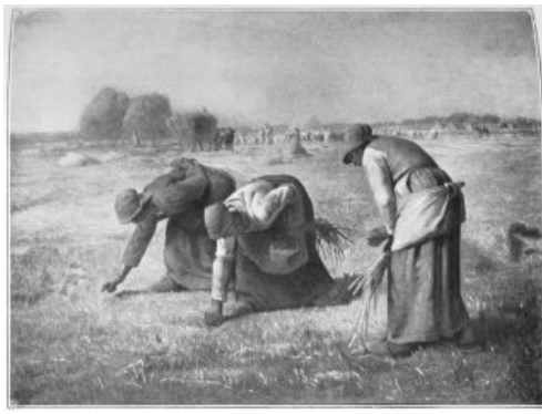
Plate 3.—Millet. "The Gleaners." In the Louvre.

his, Nicolas Poussin and Pierre Corneille, should have been Normans like himself. In the severely restrained, grandly simple, profoundly classical work of these three men, that hard-headed, strong-handed, austere, and manly race has found its artistic expression.