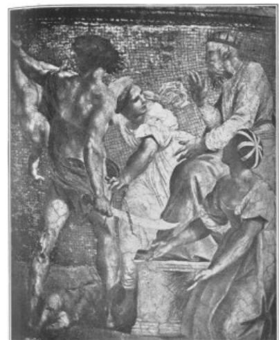
Plate 12.—Raphael. "The Judgment of Solomon." In the Vatican.