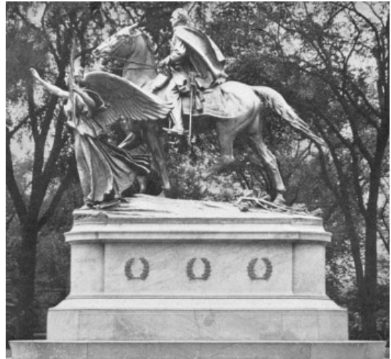
Plate 32.— Saint-Gaudens. "Sherman."

I have described and discussed but a few of the many works of this great artist, choosing those which seem to me the most significant and the most important, and in doing so I have keenly felt the inadequacy of words to express the qualities of an art which exists by forms. Fortunately, the works themselves are, for the most part, readily accessible. In the originals, in casts, or in photographs, they may be studied by every one. Nothing is more difficult than to estimate justly the greatness of an object that is too near to us—it is only as it recedes into the distance that the mountain visibly overtops its neighboring hills. It is difficult to understand that this man so lately familiar to us, moving among us as one of ourselves, is of the company of the immortals. Yet I believe, as we make this study of his works, as we yield ourselves to the graciousness of his charm or are exalted by the sweep of his imagination, we shall come to feel an assured conviction that Augustus Saint-Gaudens was not merely the most accomplished artist of America, not merely one of the foremost sculptors of his time—we shall feel that he is one of those great, creative minds, transcending time and place, not of America or of to-day, but of the world and forever.