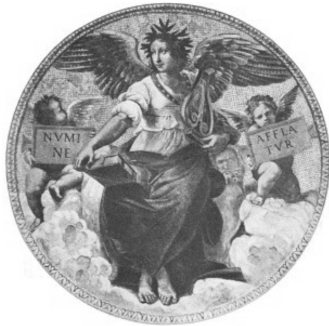
Plate 11.—Raphael. "Poetry." In the Vatican.

If the composition of the rectangles is less inevitable it is only because the variety of ways in which such simple rectangles may be filled is almost infinite. Composition more masterly than that of the "Judgment of Solomon" (Pl. 12), for instance, you will find nowhere; so much is told in a restricted space, yet with no confusion, the space is so admirably filled and its shape so marked by the very lines that enrich and relieve it. It is as if the design had determined the space rather than the space the design. If you had a tracing of the figures in the midst of an immensity of white paper you could not bound them by any other line than that of the actual frame. One of the most remarkable things about it is the way in which the angles, which artists usually avoid and disguise, are here sharply accented. A great part of the dignity and importance given to the king is due to the fact that his head fills one of these angles, and the opposite one contains the hand of the executioner and the foot by which the living child is held aloft, and to this point the longest lines of the picture lead. The dead child and the