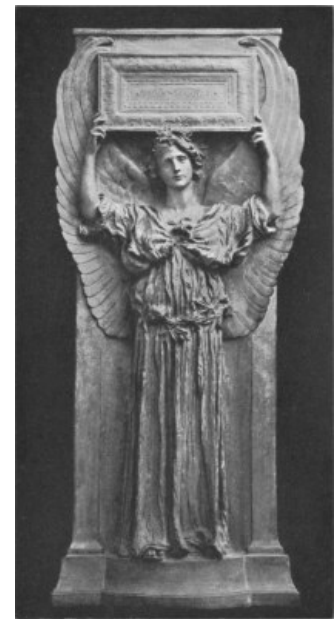
Plate 24.— Saint-Gaudens. "Amor Caritas."

Saint-Gaudens's mastery of low relief was primarily a matter of this power of design, but it was conditioned also upon two other qualities: knowledge of drawing and extreme sensitiveness to delicate modulation of surface. And by drawing I mean not merely knowledge of form and proportion and the exact rendering of these, in which sense a statue may be said to be well drawn if its measurements are correct—I mean that much more subtle and difficult art, the rendering in two dimensions only of the appearance of objects of three dimensions. Sculpture in