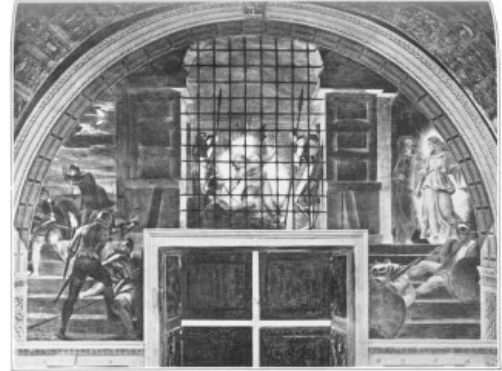
Plate 18.—Raphael. "The Deliverance of Peter." In the Vatican.