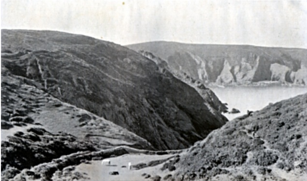
BELOW BEAUMANOIR. "And in Sercq, the headlands were great soft cushions of velvet turf, the heather purpled all the hillsides, and, on the gray rocks below, the long waves shouted aloud because they were free." This is the slope below "BEAUMANOIR," looking into PORT ES SAIES.

In building the prison in so marshy a district, advantage had been taken of a piece of rising ground. The enclosure was built round it, so that the middle stood somewhat higher than the sides, and standing on that highest part one could see over the sharp teeth of the stockade and all round the countryside.