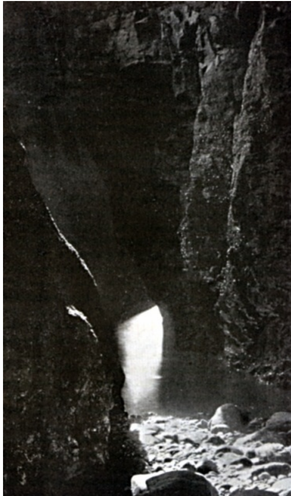
THE WATER CAVE. "The roof and walls were studded with anemones of every size and colour."

place, being together, and having that within us which made for glad hearts, we were very well content, though still hoping soon to be out again in the free air and sunshine.