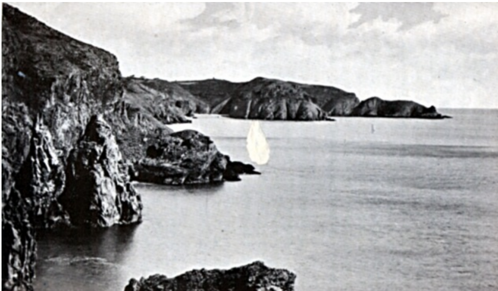
DIXCART BAY. Where the Herm men landed, is in the centre of the picture, right below the ruined mill on HOG'S BACK. The straight-walled cliff on the right of the bay is where the Sark men took their stand. The out-stretching point on the right is DERRIBLE.