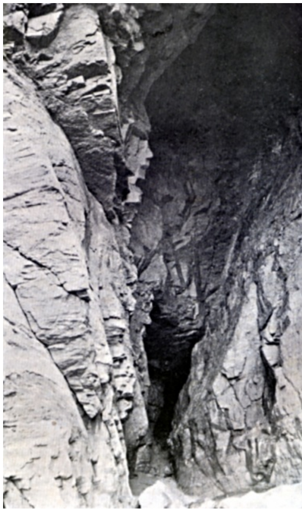
IN THE CLEFT OF A ROCK.