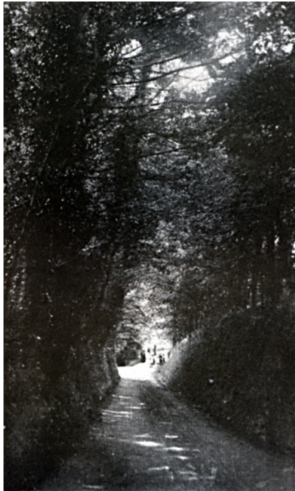
A QUIET LANE. "The quiet gray lane, with its fern-covered banks and hedges of roses and honeysuckle."

"Aw, I know! Gallop away back, my boy. And—say, Phil, mon gars,—don't let that young cub from Herm get ahead of you. He's been making fine play while you've been away." And I waved my hand and sped back to the merrymaking.