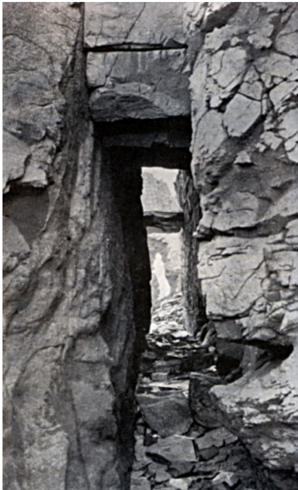
THE LADY GROTTO. "We knew every rock and stone, and every nook and cranny of the beetling cliffs." This is the