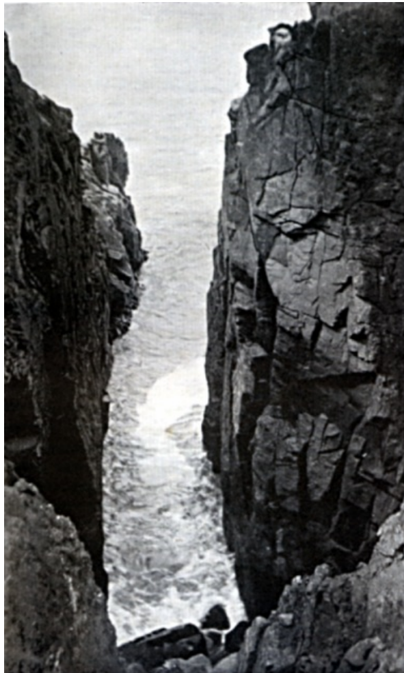
THE CHASM OF THE BOUTIQUES. "The tide was still churning among its slabs and boulders."

"Your grandfather thinks he must have broken a blood-vessel yesterday. He is in there."