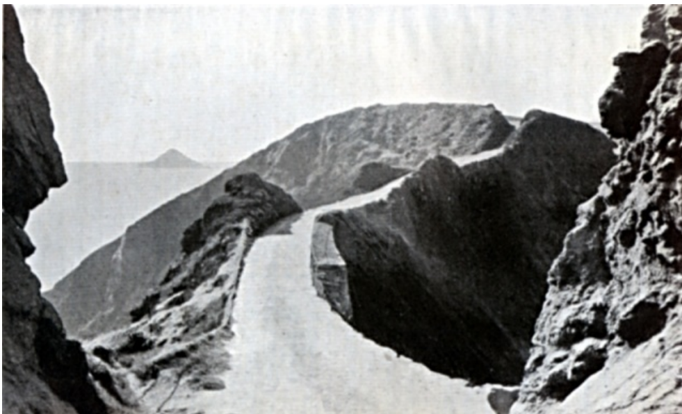
THE COUPÉE. Leading from SARK to LITTLE SARK. At the time of the story, the path was much narrower than now, there were no supporting walls, and it was continually breaking away. The pinnacles of the buttresses were also much higher. The Island to the left is LE TAS or L'ETAC.

But these times were better, even though death came weltering close behind us. For, come what might, we were man and woman, and all the man within me, and what there might be of God, clave to this sweet woman who sat before me—who sat of her own choice between me and death—and I knew that she loved me as I loved her, and my heart was full and glad in spite of the hunting Death behind.