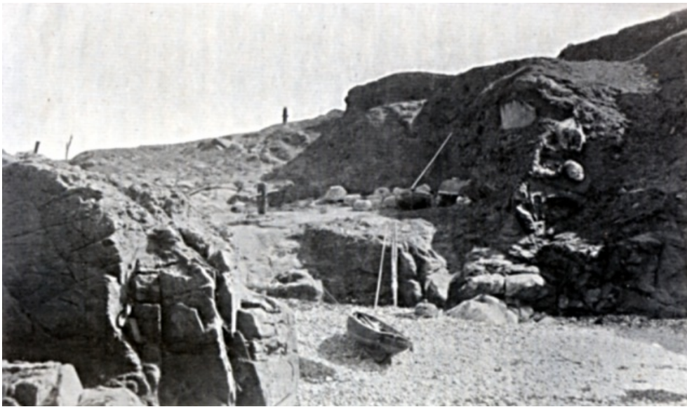
EPERQUERIE BAY. Showing the bluff from which the men of SARK fired down on the men of HERM as they landed the boats.