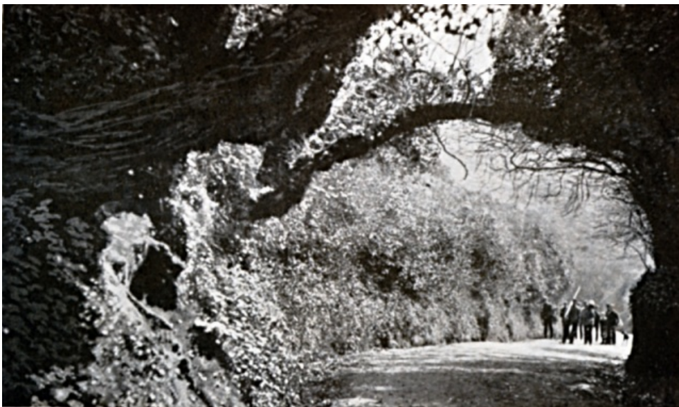
THE CREUX ROAD, Which leads straight up to the life and centre of the Island.

As you draw in to the coast across the blue-ribbed sea, which, for three parts of the year, is all alive with dancing sunflakes, the smooth bold ridge resolves itself into deep rents and chasms. The great granite cliffs stand out like the frowning heads of giants, seamed and furrowed with ages of conflict. The rocks are wrought into a thousand fantastic shapes. The whole coast is honeycombed with caves and bays, with chapelles and arches and flying buttresses, among which are wonders such as you will find nowhere else in the world. And the rocks are coloured most wondrously by that which is in them and upon them, and perhaps the last are the most beautiful, for their lichen robes are woven of silver, and gold, and gray, and green, and orange. When the evening sun shines full upon the Autelets, and sets them all aflame with golden fire, they become veritable altars and lift one's soul to worship. He would be a bold man who would say he knew a nobler sight, and I should doubt his word at that, until I had seen it with my own eyes.