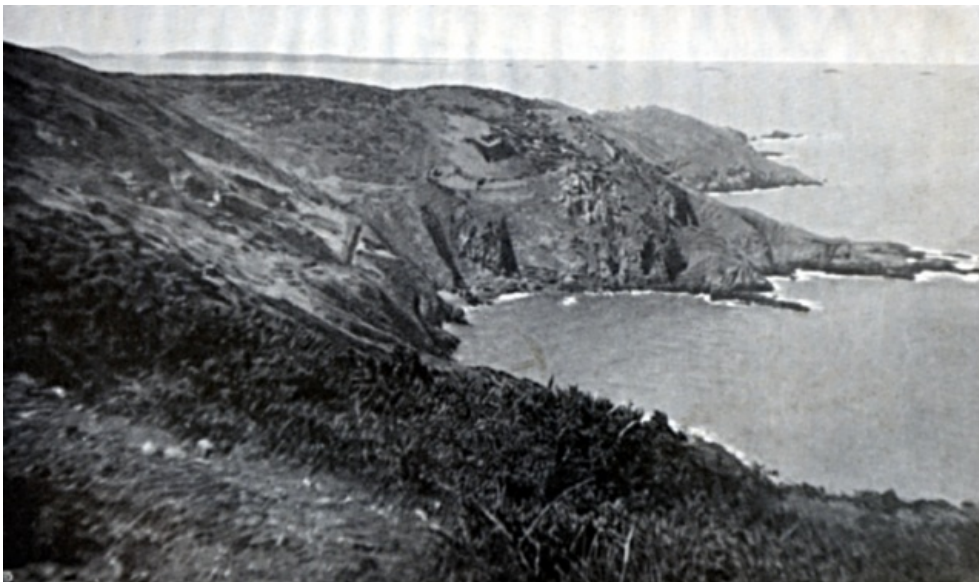
THE EPERQUERIE. Above the shoulder of the hill to the left, JETHOU just appears; the larger island with the long painted beak is HERM, with her string of islets like a fleet of ships speeding to the north. The lower of the two out-jutting headlands is where the Herm men landed. The higher is BEC DU NEZ, the most northerly point of SARK.

We chatted, by snatches, of the party and of things that had happened in my absence. But of the sweet whispers and little confidences which should set all riders on Riding Day above all the rest of the world, there were none between us, and at times we fell to silence and a touch of constraint.