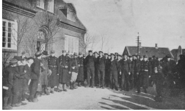
AT SKAGEN: GERMAN PRIZE CREW OF THE IGOTZ MENDI UNDER GUARD, AWAITING INTERNMENT.

nights, for we felt we must still hold ourselves ready for any emergency. Arrived in London we were taken forthwith to the Admiralty, and there interrogated by the authorities as to the Wolf's exploits. Our adventures were really at an end at last.