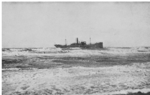
THE IGOTZ MENDI ASHORE AT SKAGEN. Taken on the morning of our rescue.

On the 20th we were off Bergen, and saw the coast in the distance. I suggested to the Captain that it would save much trouble if he would land us there. He replied that he would very much like to, but was afraid it was quite impossible! I further asked him whether, if we were ultimately rescued, he would give us a pass conferring further immunity from capture at sea by the enemy, as we felt we had had more than our share of captivity at sea. He said he was afraid that would be against regulations! The next day we were nearer the coast and saw a couple of suspicious