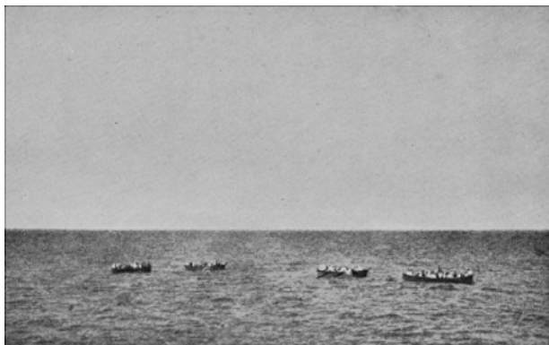
HITACHI PASSENGERS AND CREW IN LIFEBOATS AFTER THEIR SHIP HAD BEEN SHELLED.

What a sudden, what a dramatic change in our fortunes! One that easily might have been, might even yet be, tragic. At half-past one, less than two hours before, we were comfortably on board a fine ship, absolutely unsuspecting of the least danger. If any of us had thought of the matter at all, we probably imagined we were in the safest part of the ocean. But, at three o'clock, here we were, having undergone the trying ordeal of shell-fire in the interval, drifting helplessly in lifeboats in mid-ocean, all our personal belongings left behind in what we imagined to be a sinking ship, not knowing what fate was in store for us, but naturally, remembering what we had heard of German sea outrages, dreading the very worst.