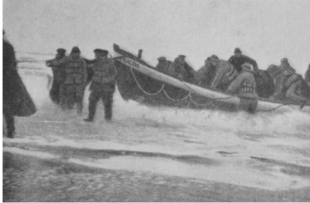
THE SKAGEN LIFEBOAT BRINGING TO SHORE THE PRISONERS FROM THE IGOTZ MENDI .

We had been saved at the eleventh hour, almost the fifty-ninth minute of it; we were almost in German waters, at the very gates of Germany, being due at Kiel the very next day. It was a miraculous escape if ever there was one, and came at a moment when all hope had gone. Would that the Wolf had gone ashore in the same place! All our fellow-countrymen on board her would then have been free, and they could have given information and saved us as well.