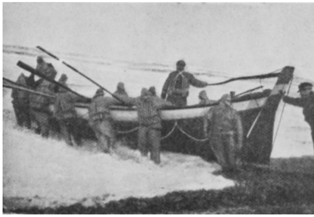
THE SKAGEN LIFEBOAT GOING OUT TO THE IGOTZ MENDI TO BRING OFF THE PRISONERS.