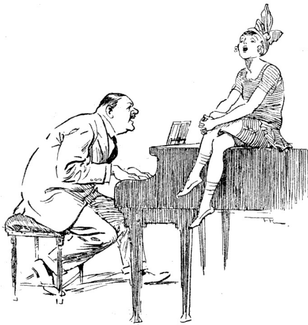
"I want to spread a little sunshine." James Smith ... Mr. CHARLES HAWTREY. Eva Johns ... Miss JOAN BARRY.