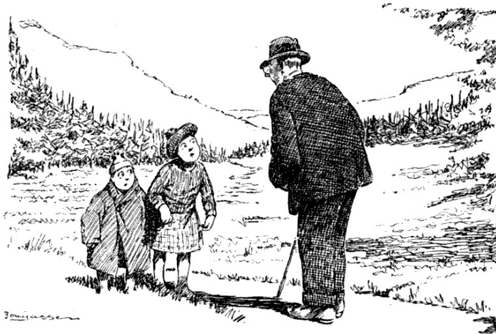
Wee Donald Angus . "PLEASE, SIRR, WHAT TIME WULL IT BE?" Literal Gentleman . "WHEN?"

"He brightened up a lot when his mother-in-law arrived," said an onlooker.—" Provincial Paper ."