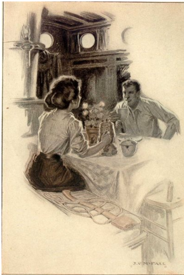
Opposite, smiling at him, as though they had breakfasted together for years, was the radiant girl. [Page 236]

And opposite, smiling at him, talking to him as though they had breakfasted together for a number of years, was the most radiant girl he had ever looked upon. The simple costume was wonderfully effective. The white, full throat and the curves of the neck running to the shoulders were revealed by the low rolling collar, and the hair coiled low shone with lustrous sheen.